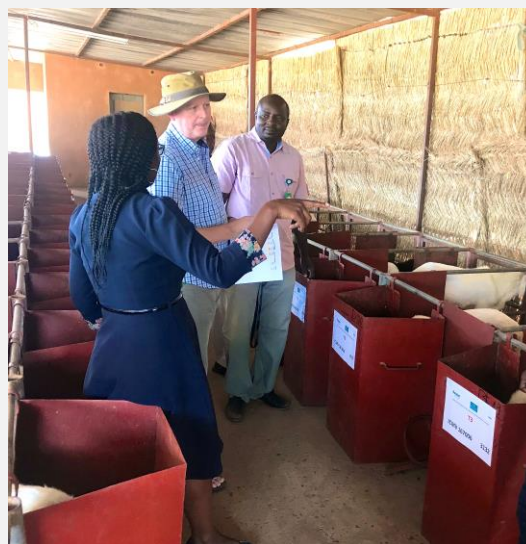
Picture 2. Feeding experiment of sheep fed with stover of different millet varieties