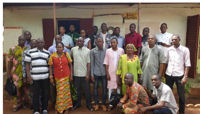
Figure 1. Photo of the participants who took part in the PICSA training of trainers.

In West Africa, the PICSA approach has been implemented in Ghana 1 , Mali 2 and Senegal 1 , under the CCAFS funded project "Capacitating African Smallholders with Climate Advisories and Insurance Development (CASCAID-I)" lead by the International Crops Research Institute for the Semi-Arid Tropics (ICRISAT) and World Agroforestry (ICRAF). This yielded a collaboration between the CCAFS and Africa RISING programs to scale out climate information services (CIS) in the Africa RISING sites (Figure 2) in Bougouni, Mali, through the dissemination of the PICSA approach, in order to capacitate farmers and enable them to practice more productive, resilient, profitable and sustainable intensified