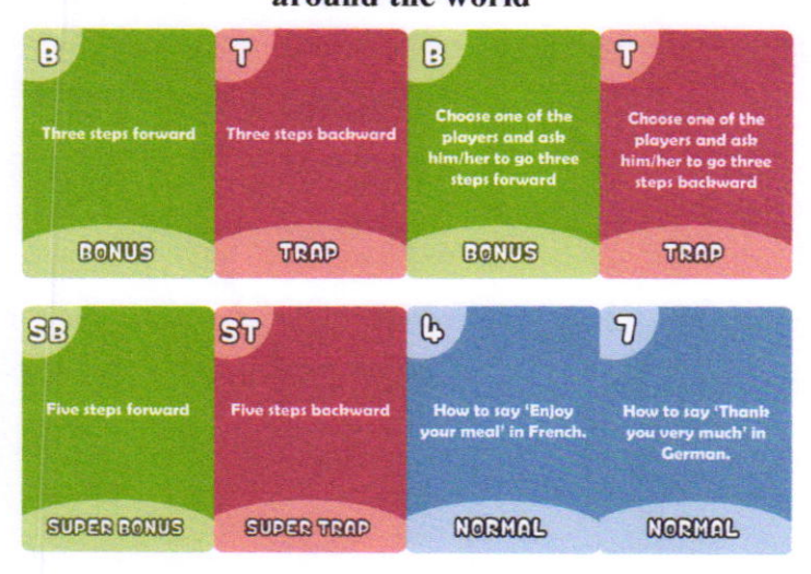
Figure 2: kinds of cards of a cross-cultural trip