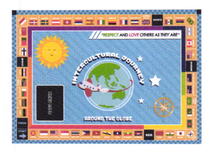
Figure 1: the game board of a cross-cultural trip around the world