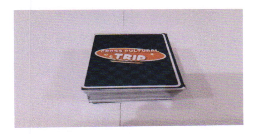
Figure 4: cards of a cross- cultural trip (back)