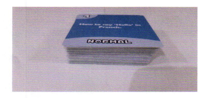
Figure 3: cards of a cross- cultural trip (above)