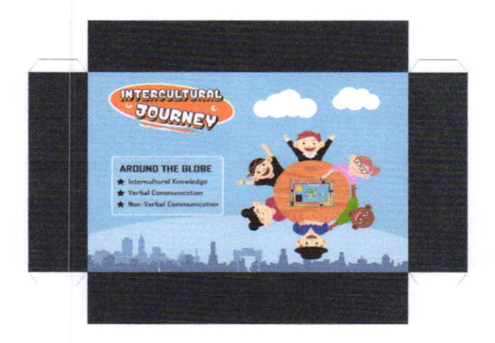
Figure 5: The box of the game A Cross-cultural trip around the world