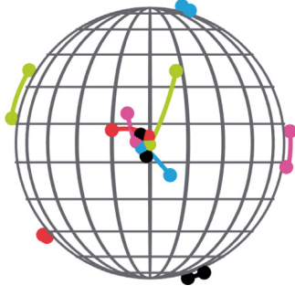
Fig. 3. The trajectories of five agents on \text{St}(2, 3) that are connected by the graph \mathcal{H}_5 . Each agent state is represented as an orthogonal pair of vectors on S^2 . The agents are initially perturbed away from the equilibrium set \mathcal{Q}_{23} but ultimately end up close to it.

Each element of \text{St}(2, 3) is a pair of orthogonal unit vectors (\mathbf{S}_i \mathbf{e}_1, \mathbf{S}_i \mathbf{e}_2) \in S^2 \times S^2 . They can be visualized as pairs of points on a single sphere. Consider the equilibrium set