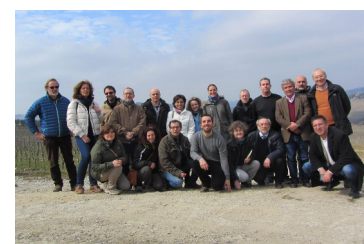
The group at the kick-off meeting

ACKNOWLEDGEMENTS: The author(s)/editor(s) acknowledge the financial support for this project provided by transnational funding bodies, being partners of the FP7 ERA-net project, CORE Organic Plus, and the cofund from the European Commission.