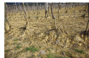
Roots exposed because of soil erosion