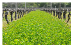
Different types of green manure