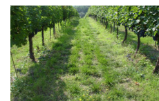
Permanent cover crop and dry mulching