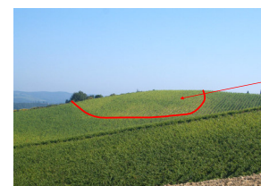
Degraded area within vineyard