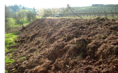
Compost preparation and adding into the soil