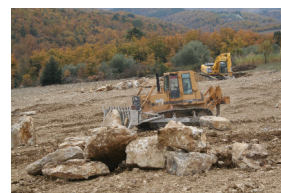
Land preparation for planting a vineyard in Italy

In both conventional and organic European vineyards, it is not uncommon to have areas characterized by problems in vine health, grape production and quality. These problems are very often related to sub-optimal soil functionality, caused by an improper land preparation before vine plantation and/or management. Different causes for soil malfunctioning can include: poor organic matter content and plant nutrient availability (both major and trace elements); imbalance of some element ratios (Ca/Mg, K/Mg, P/Fe, and Fe/Mn); pH; water deficiency; soil compaction and/or scarce oxygenation.