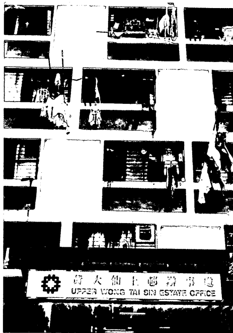
Public housing: Nests of half Hong Kong population

items among the colony's fiscal revenue. The share of proceeds from land sales, which may be described as a benefit of monopolized ownership, moved on as follows. It accounted for over 30% of Hong Kong's revenue in 1980 and 1981, when it recorded the highest share. It also accounted for