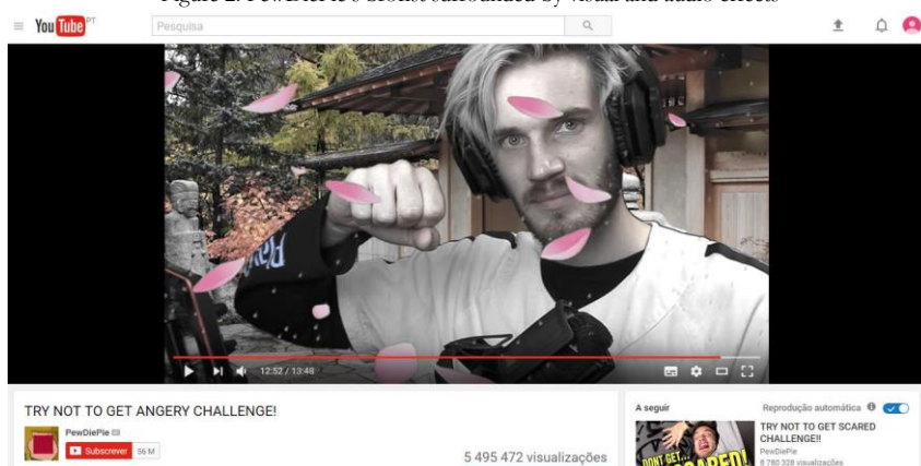
Figure 2: PewDiePie's brofist surrounded by visual and audio effects

second and fifth most watched videos). In ‘TRY NOT TO GET ANGRY CHALLENGE!’, for instance, his trademark farewell gesture represents one of the most relevant moments of familiarity with his ‘bros’: in a slow movement, accompanied by visual and sound effects (greyish image, petals falling, and a well-known tune from the film Titanic clumsily played on a flute as soundtrack) the YouTuber signs off with: «And as always, bros, brofist. Are you ready? It's coming. It's coming, I promise. I'm not gonna do anything. We have a trust, you and I» (Figure 2).