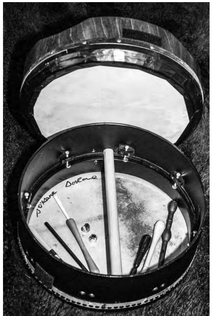
Photograph 23. Two bodhrans and some tippers 7

The smaller Bodhran (pronounced bow-ran), varying between around 12” to around 20”, gets its name from the Irish for deaf ‘bodhr’ and means ‘the deafener’ (Photograph 23). It is usually made from goatskin but may be made from a variety of other skins including dogskin. Frame drums broadly, like this, are very ancient and found all over the world, but Ireland has a range of characteristic styles of playing. This is most commonly with one hand using a double-ended stick which again can be made from a variety