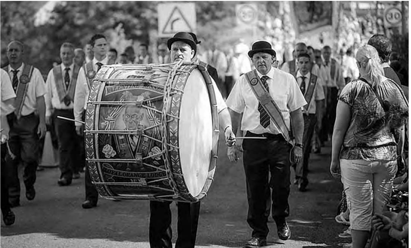
Photograph 22. Lambeg player at Newtownhamilton parade

band bass drum, and more technical to play. At up to 120dB it is also reputed to be the loudest drum in the world and can be heard up to six miles away when played outdoors, as it is in parades and some competitions. The ways in which the drum is constructed (with very high quality imported female goat skins), tensioned (with ropes, which takes two people), tuned (with hammers), and played (with canes) are unique to Ulster. Although according to Atkinson (n.d.) the drum was at one time used by Nationalist organization the Ancient Order of Hibernians this was discontinued as the drum came to function as a powerful and unmistakable symbol of the Protestant and Unionist communities who regard it as ‘the heartbeat of Ulster.’