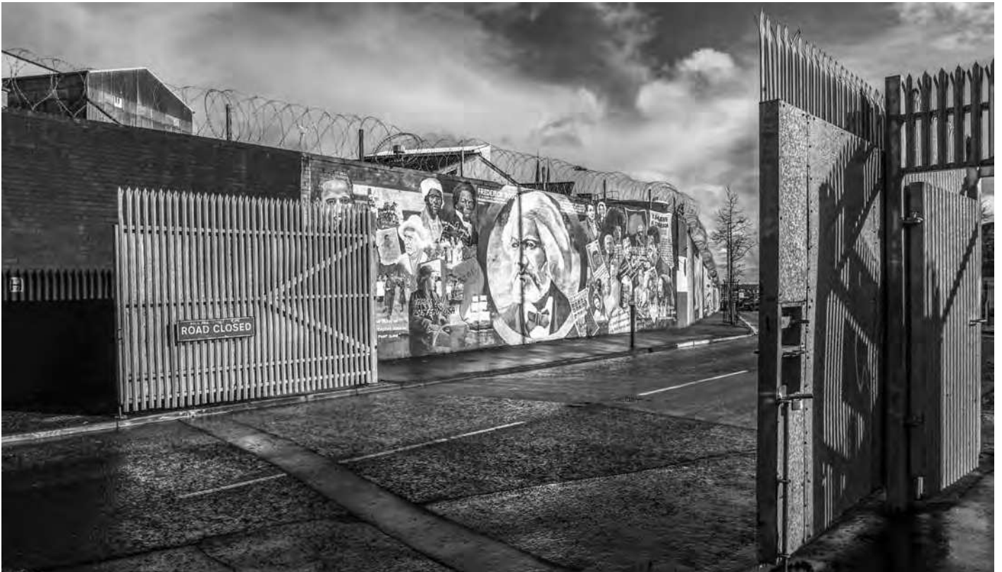
Photograph 7. Northumberland Street gate – Divis Street side

where there is no sense of communities trying to express themselves; they're merely trying to protect themselves. Gates, where they appear across the access roads through the walls, may be closed on curfew or at particular periods