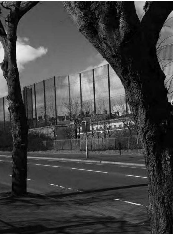
Photograph 5. Springfield Road

The wall here appears as a scar slashed across this part of the city. Elsewhere, functionality also predominates, as on Springfield Road (see Photograph 5) or Clandeboyne Gardens in Short Strand in East Belfast (see Photograph 6),