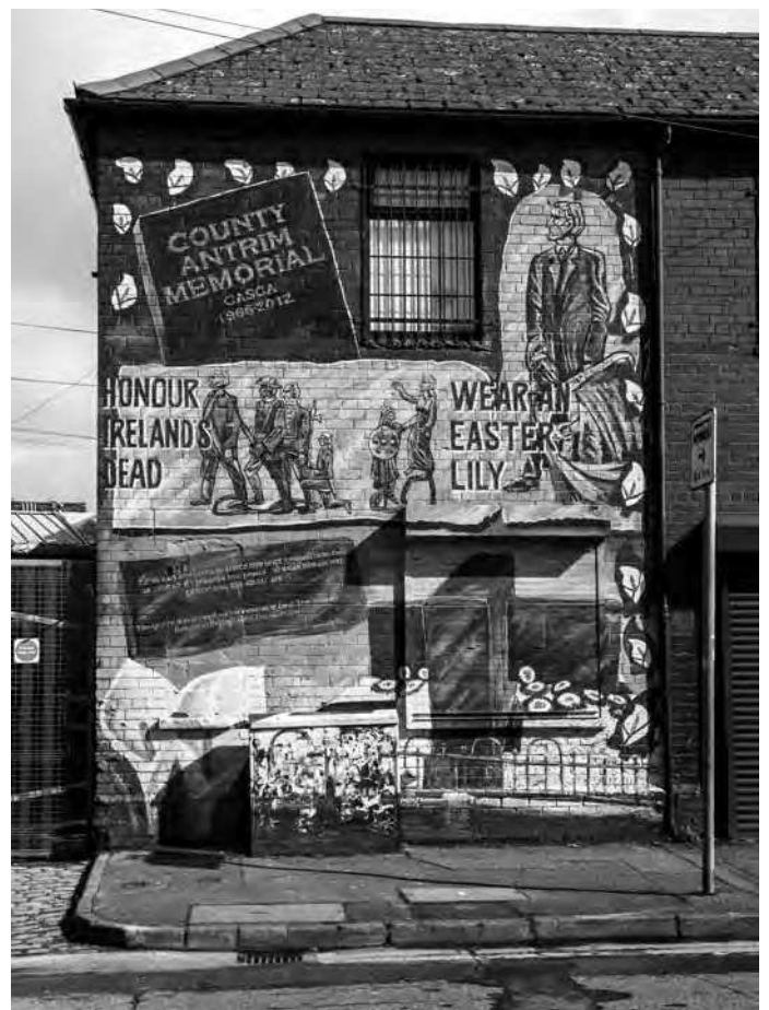
Photograph 12. County Antrim memorial Beechmont Avenue