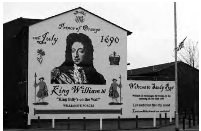
Photograph 2. Protestant mural – King Billy, Sandy Row