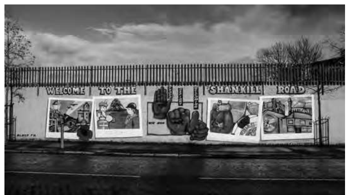
Photograph 3. Protestant mural – Welcome to Shankill between communities.