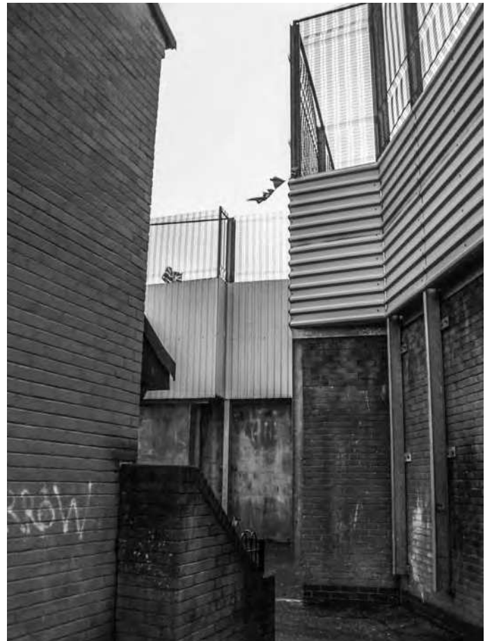
Photograph 6. Clandeboyne Gardens