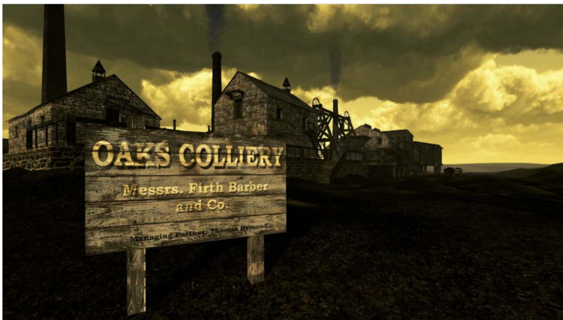
The approach to the Oaks Colliery.