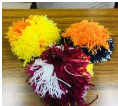
Figure 1: community ball

pioneered by a group of practitioners of p4c HI, intended to create “intellectual safety”, At the beginning of the semester, students made this ball collaboratively so that this ball “becomes a symbol of a powerful symbolic shift in the circle regarding the authorization of the right to speak” (Jackson, 2013, p.102).