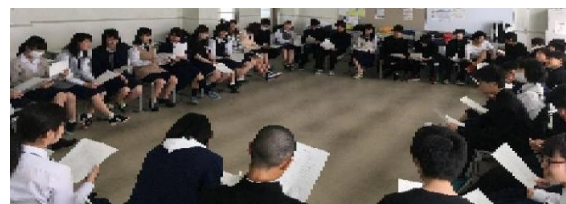
Figure 3: p4c style in Ube

In Ube college, we have the class “Rinri (ethics)” for the second grade students (16-17years old) and “Gendai Shakai” (Civics)” for the first grade students (15-16years old). Like Tokyo college, we used textbook officially authorized by the Japanese Government. We use the textbook not only for transferring knowledge but also for doing P4C dialogue (see Figure 3).