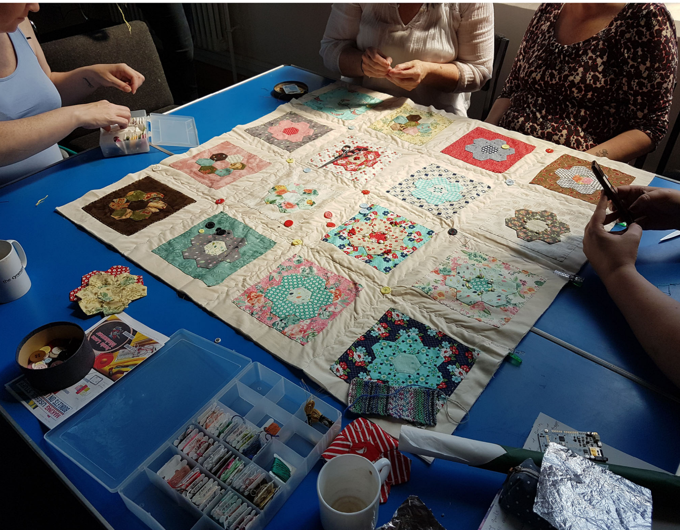
Figure 1. These photos were taken throughout the process of making the quilt. Top left: Quilted electronics and controller; Top right: Traditional and digitally-augmented layers of the quilt; Bottom: Women involved in sewing the quilt. [Color figure can be viewed at wileyonlinelibrary.com ]