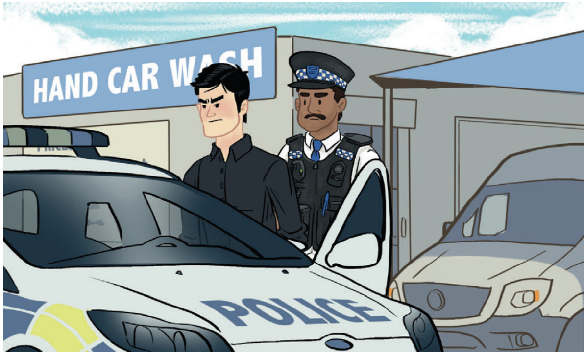
Figure 1: AEsOP Concept Art - Modern Slavery Scenario