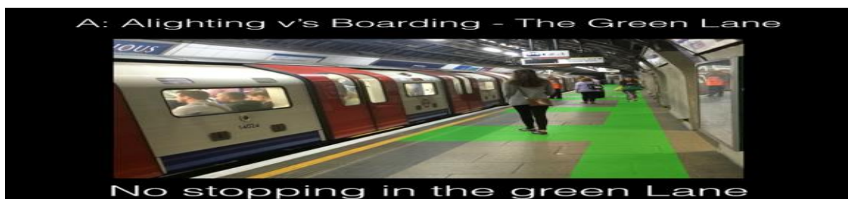
Figure 2: Green lanes at London King’s Cross station. Adapted from Goodwin, 2015.

To perform the experiment the Victoria line at London King’s Cross station was chosen because of its central location and the persistent increases in dwell times in recent years. King’s Cross station is a major hub and terminal with connections to many parts of London and the United Kingdom. The Victoria line serves several central and very important stations linking many of London’s landmarks, central and suburban districts. It was completed in 1968 as a new line on London Underground network and was designed to reduce congestion on other lines like the Piccadilly line. However, dwell times have increased due to congestion brought about by persistent rise in travel demand over the years. King’s Cross station constitutes a pinch point location and a bottle neck on the Victoria line, but only the southbound Victoria line was chosen for treatment because the dwell times on this platform increased significantly from 35 seconds to 47 seconds between 2015/16 working timetables (Goodwin, 2017).