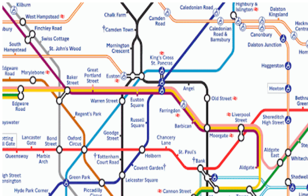
Figure 1: Section of the Tube Map.

and Paris. The central zones are the busiest and connect passengers to many of London's landmarks and financial hubs.