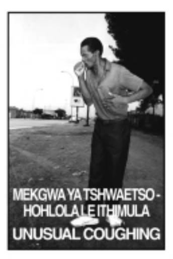
Figure 2 An example of one of the final display cards "unusual coughing". The background is in black and white, whilst the figure is in full colour. Unusual coughing could be a symptom of Tuberculosis.

in one photograph. The food in one card was unacceptable as it did not represent the local brands and familiar food items. The final card displayed locally available branded food items. See Figure 3.