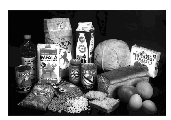
HO FEPA KA TEKANO PHEPO E NEPAHETSING BALANCED DIET

in one photograph. The food in one card was unacceptable as it did not represent the local brands and familiar food items. The final card displayed locally available branded food items. See Figure 3.