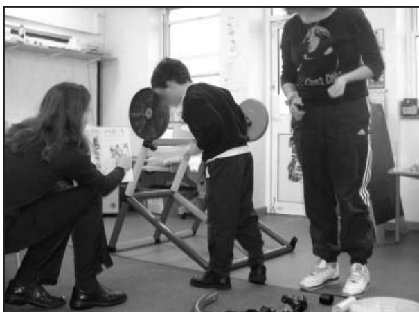
Figure 4: Developing Quadro® models of playground equipment

Teacher C, teaching pupils with BESDs, in a primary special school focused on a project to design and build a piece of playground equipment (Figure 4) using Quadro® (a large scale frame construction kit).