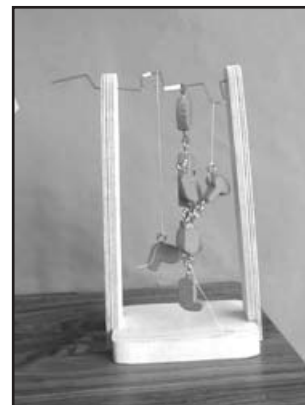
Figure 7: Pupil's mechanical puppet

Teacher D found that in a mechanical puppet project, in order to raise pupils' self esteem, it was necessary to guarantee a successful outcome. He achieved this by using a simple means to alleviate the usual friction problems associated with mechanical projects of this type (Figure 7). When this mechanism proved to be problematic he was then able to attach the puppet to a wooden cross (similar to a traditional string puppet), thus further guaranteeing success.