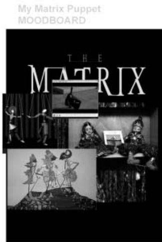
Figure 8: Pupil's 'mood board' and design ideas sketches for the mechanical puppet

In a similar way Teacher D used ICT to assemble mood boards (Figure 8) to inform the development of their puppet designs.