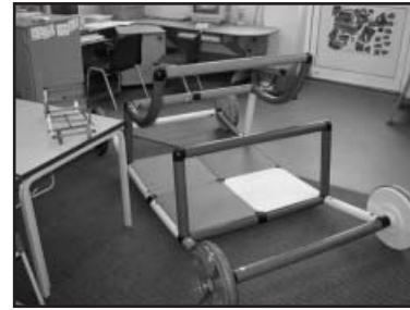
Figure 6: Completed scale and full size model playground equipment

Teacher C's project revolved around making a piece of playground equipment (Figure 6) that could be used by others. The children felt 'a huge sense of prestige and pride' as their project, was used and enjoyed in the playground by pupils at the school.