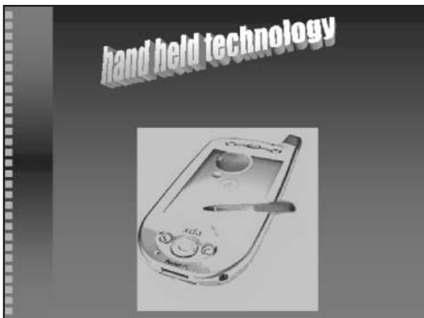
Figure 3: Page from pupil's e-portfolio

Teacher B, teaching a child with BESDs in a mixed ability secondary school class, focused on a project to design and model a piece of hand held technology (Figure 3).