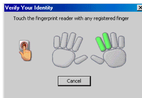
Figure 1: Fingerprint recognition system.

In the first stage of our research, the use of fingerprint recognition was tested. Finding from these studies suggested that although this system proved to be useful and reliable,, they were difficult to implement and manages remotely at some locations. Tests with the Microsoft fingerprint reader showed that it was relatively simple to install, important for remote learners. Registration of fingerprints was through a wizard. The finger print registration wizard allows you to register fingerprints by selecting the preferred hand and finger and then following the prompts to scan. Each finger must be successfully scanned four times and you can register up to 10 fingers. You can register other fingers at any time by using a registered finger to access the registration wizard.