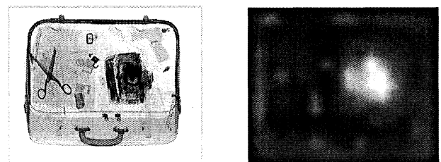
Fig. 3. Example of an X-ray luggage image (left) and its generated saliency map (right).

For each of the 30 X-ray luggage images a visual saliency map was calculated. Then the mean saliency at the first fixation location of each participant for all images was found. The saliency at the first fixation location of screeners and naïve observers was 137 and 140, respectively. The difference was not significant, t(14) < 1 .