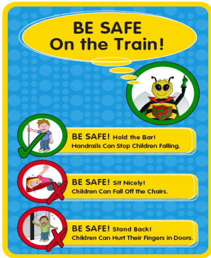
Figure 3: Example poster designed based on the outcomes from Workshop 2