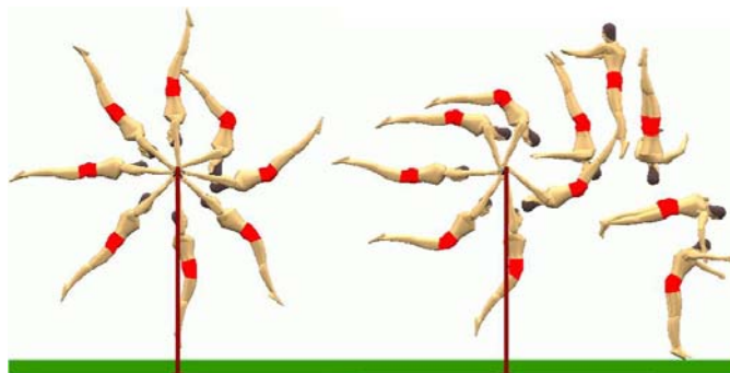
Figure 1. A double straight (layout) somersault dismount with two twists along with the preceding 1\frac{3}{4} backward giant circles (starting from the handstand position above the bar).

The dismount from the high bar is one of the most spectacular skills performed in Men's Artistic Gymnastics. The majority of dismounts performed in elite competition comprise a double somersault with a straight (layout) body configuration with one or more twists (Figure 1). While the number of twists in the double layout somersault has increased over the years, a triple layout somersault dismount has yet to be performed in competition. On the other hand gymnasts do perform triple tucked and triple piked somersault dismounts in competition. What then are the limiting factors for dismounting with a triple layout somersault?