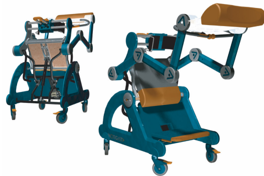
Fig. 4: Motigait