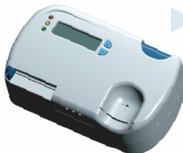
Fig. 3: Lancitor

Natalie Scott has patented her design for a monitor to aid the management of diabetes and is hoping to get it into production. She found that the apparent restrictions of designing inclusively led her to a more innovative and simpler solution than she might otherwise have attained. Lancitor (Fig. 3) is a blood analysis monitor for visually impaired diabetics that would also benefit other users, combining lancet and monitor in one product. The product pricks the finger with one touch of a button while button two winds on the test strip roll (which is pre-loaded) for the next use. Nodules on the buttons are used to differentiate between the functions, and a locking device would operate when the product was not in use. The roll is replaced like a camera film, by slotting it into the product. Natalie is now working in the inclusive design team at Scientific Generics, a leading integrated technology consultancy with an international reputation for commercialising science and technology.