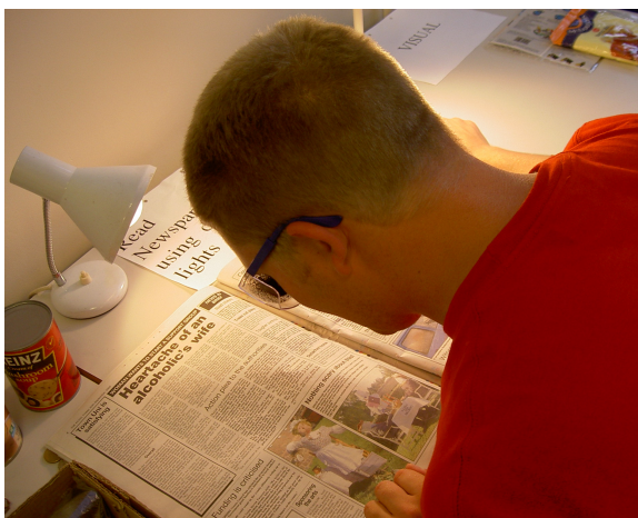
Fig. 2: Empathic Modelling Workshop

In brief, the method consists of performing various visual, dexterity, hearing and mobility tasks wearing simulation materials. For examples, spectacles simulating a range of visual impairments are worn whilst reading the newspaper and using different intensity light sources to emphasise the difference that increased lamination can make (Fig. 2). Buttons are taped onto the knuckles to simulate the effect of older and arthritic fingers, causing discomfort or pain, and the students perform tasks like opening packets and jars of food. The detailed steps and ‘props’ which are used can be found in Nicolle and Maguire [5].