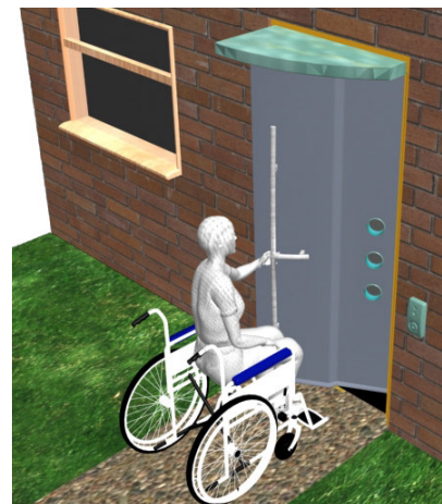
Fig. 5: Uniport

His Motigait (Fig. 4 above) is a rehabilitation product which helps disabled children to develop walking skills and also acts as a physiotherapy tool for adults to allow rehabilitation of weak muscle groups, for instance to help restore function after a stroke or sports injury. The product consists of a flexible neoprene harness that supports the user while allowing movements critical to rehabilitation, such as rotation. The lifting mechanism assists and guides the user rather than forcing the occupant into a standing position. The frame construction moves away from square section steel tubing in order to dispel the stigma attached to such products.