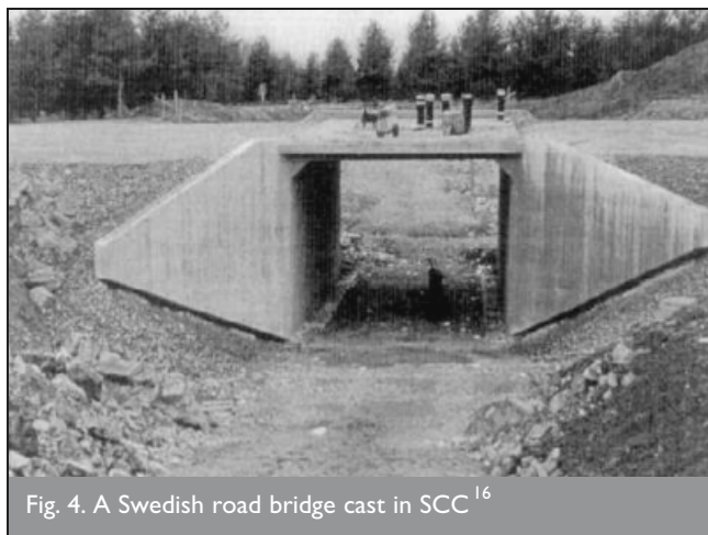
Fig. 4. A Swedish road bridge cast in SCC 16

International RILEM Symposium on SCC in Stockholm in 1999. 15 The papers included 23 from Asia, 38 from Europe, five from North America and one from Australia. The symposium attracted 340 participants from 35 countries, which is a ratio of 5 to 1 of participants to papers, indicating the increasing interest in the material in Europe.