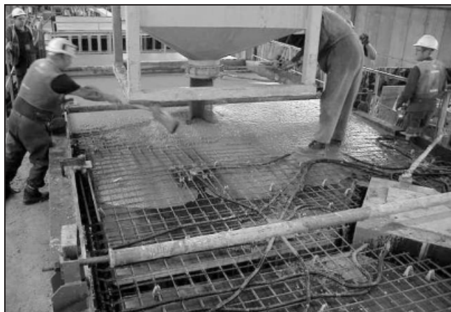
Fig. 5. A precast unit being cast in SCC (Tarmac Precast Concrete Ltd)