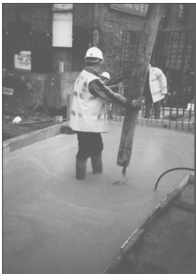
Fig. 1. Placement of SCC by pump tremie, demonstrating the flowable nature of the material

These properties must all be satisfied in order to design an adequate SCC, together with other requirements including those for hardened performance.