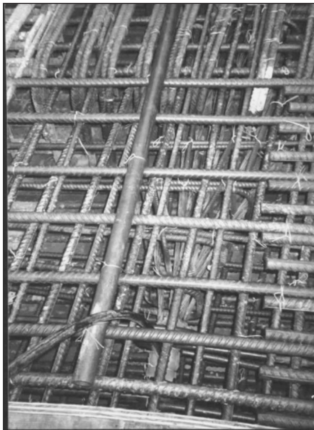
Fig. 2. An example of congested reinforcement: an ideal application for SCC (Mott MacDonald Ltd)

In addition to the benefits described above, SCC is also able to provide a more consistent and superior finished product for the client, with less defects. Another advantage is that less skilled labour is required in order for it to be placed, finished and made good after casting. As the shortage of skilled site labour in construction continues to increase in the UK and many other countries, this is an additional advantage of the material which will become increasingly important.