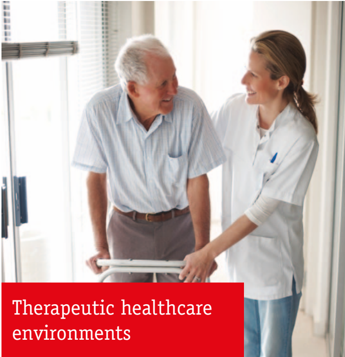
Therapeutic healthcare environments