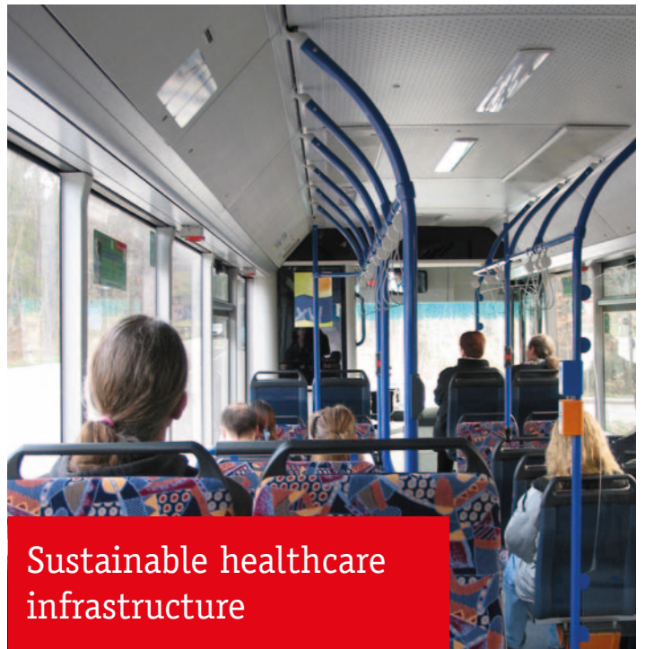
Sustainable healthcare infrastructure