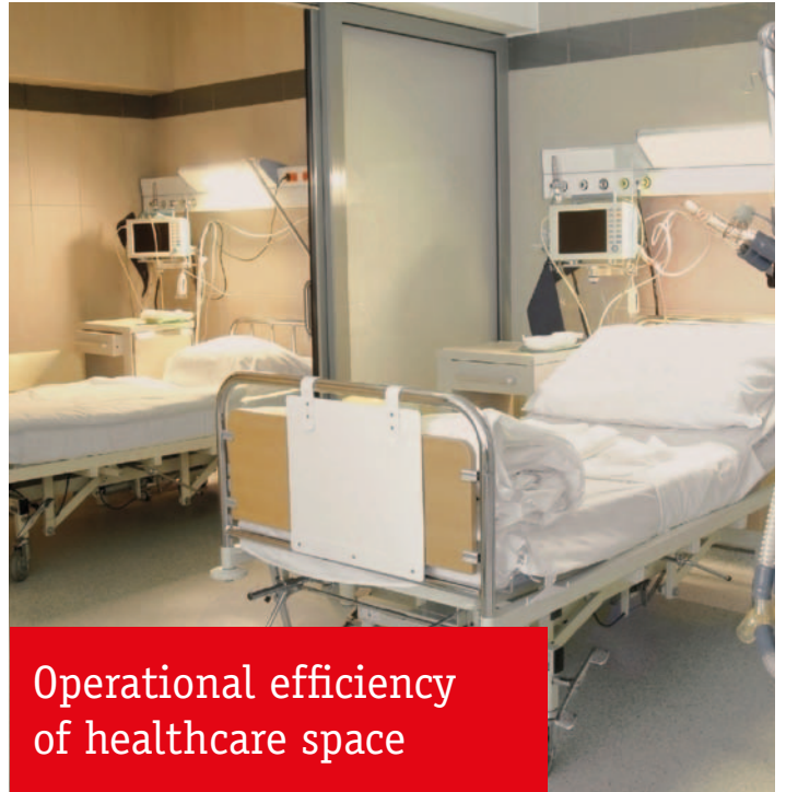
Operational efficiency of healthcare space