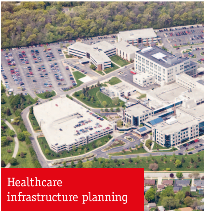
Healthcare infrastructure planning