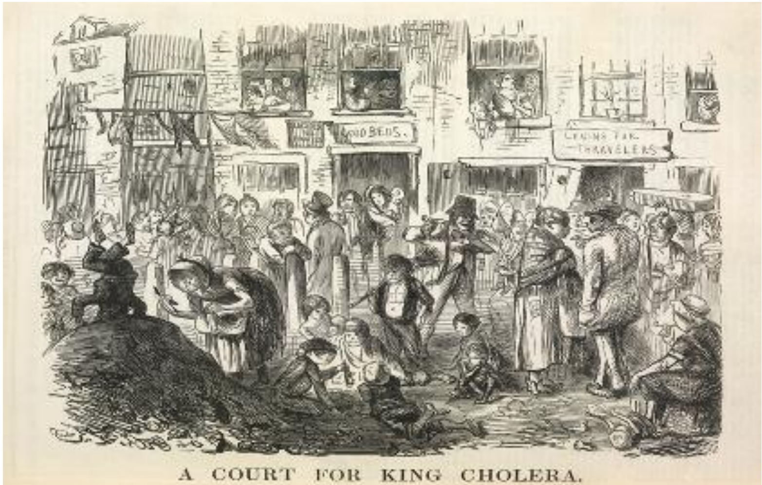
A COURT FOR KING CHOLERA.