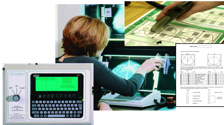
Figure 2. The original reporting form used per case and the Psion 3MX with bar code reader and bar coded forms

subject to potential transcription error. The option of using an optical reader to input these forms automatically was investigated in detail but not implemented. After data had been analysed then individuals received feedback on their performance. Unfortunately by the time an individual received such feedback then they no longer had the PERFORMS cases and so such feedback was not as useful as it could have been. Once all participants had taken part then they all received anonymous detailed feedback.