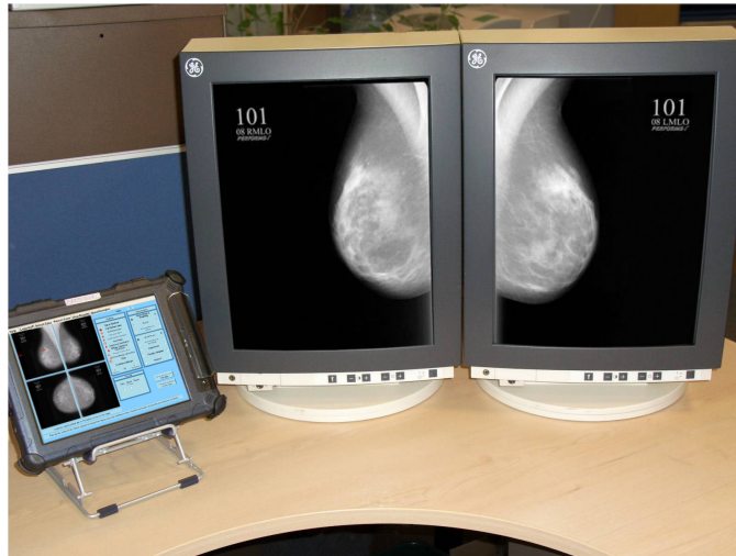
Figure 4. Tablet PC with GE workstation

As UK breast screening centres increasingly use digital screening and dispense with radiographic film then it is vital that individuals can still participate in the PERFORMS scheme. Consequently, digital versions of the scheme have been under development over the past year for release in early 2010. The ideal implementation may be to display the case sets on a screening centre's reporting workstations and overlay these with the reporting/feedback software. In the UK the latter poses various logistical difficulties and so the image display and reporting are being kept separate. The initial implementation is simply to continue to use the existing tablet PC for participants to record their various decisions but for them to view full DICOM images on their workstations (Figure 4).