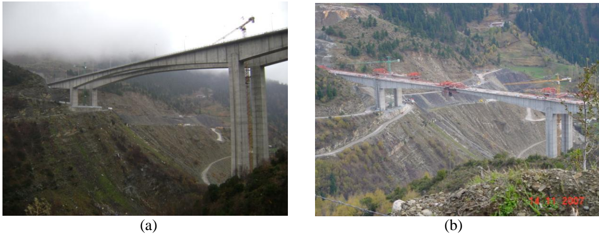
Figure 2: Metsovo bridge, (a) General view, (b) key of central span.

The proposed framework has been applied to a left section (Figure 2b) of the ravine Metsovo bridge (Figure 2a) of Egnatia Motorway. The bridge is crossing the deep ravine of Metsovitikos river, 150 m over the riverbed. This is the higher bridge of Egnatia Motorway, with the height of the taller pier M2 equal to 110 m. The total length of the bridge is 357 m.