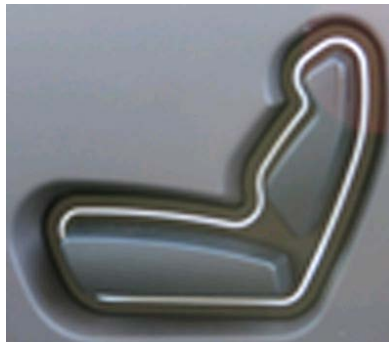
Fig. 1. A seat adjustment control which exhibits excellent natural mapping or matching between the system and the user's mental model.

The feedback allows the user to identify what state the system is in. If a performed task has resulted in anything, what task was performed etc. It is very important to allow the operator to recognize if an action had any effect on the system and also what the result of it was [10]. For example, even if a computing task on a PC takes some time to calculate, the operator is informed that the computer is working by a flashing led or an hourglass on the screen.