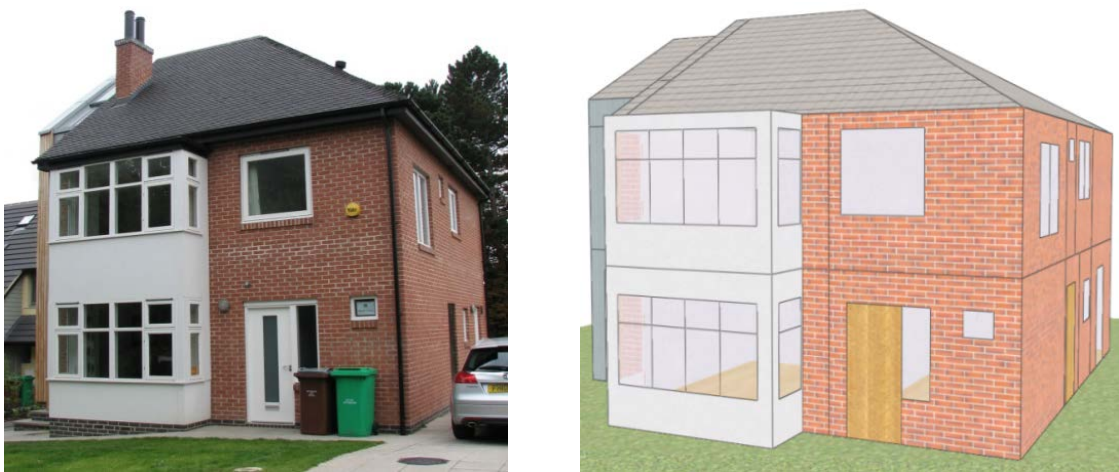
Figure 1 E.ON 2016 house at The University of Nottingham and the IES VE Dynamic Thermal Model

Dynamic thermal modelling software (IES Virtual Environment) was used to build a model of the E.ON 2016 house (Figure 1) to simulate a year's operation and calculate the annual energy consumption and CO 2 emissions. Details of the building geometry and orientation were input using the architectural drawings to create zones corresponding to each room and represent the building. The Nottingham Test Reference Year weather file (CIBSE, 2008) was used to simulate local climatic data.