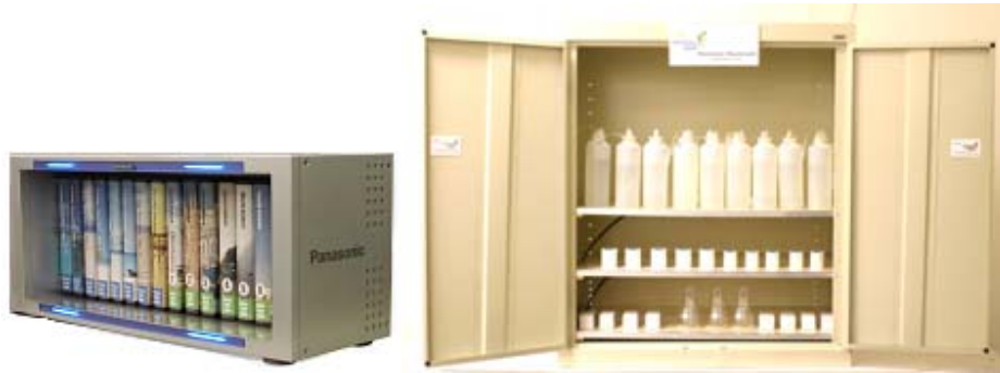
Figure 3: Smart Shelves for books (left) and pharmaceuticals (right)

Supermarkets in the world such as Wal-mart, Tesco and Metro are all testing the smart shelf technology and are expecting a massive implementation of it in the near future.