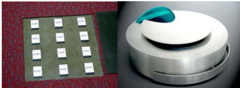
Figure 4: Passive RFID tags deployed under carpet (left), Vorwerk's smart vacuum cleaner with built-in RFID reader (right)

inside a building. This robot uses laser sensors [16] or ultrasonic sensors [17] to guide the robot and uses the RFID tags as landmarks. In [18], Miller et al. developed a system for first responders' localization using inertial sensors and the dead reckoning approach. Based on the system they studied, they proposed an option to implement passive RFID tags on the wall and floor inside buildings to assist the DR system and improve its performance. The researchers declared that they achieved enhanced accuracy of their inertial tracking systems by adding the assistance of passive RFID tags. Yang et al. [19] used a similar dead reckoning method calibrated by passive RFID tag array on the ground to locate and guide a robot in an indoor environment. They proposed a hexagon tag array and analyzed the uncertainty of the calibrating system. These RFID-assisted localization systems combine different technologies to perform tracking. Passive RFID technology is usually used only for calibration purpose, thus the accuracy of the systems vary and mainly depend on the main approaches they use.