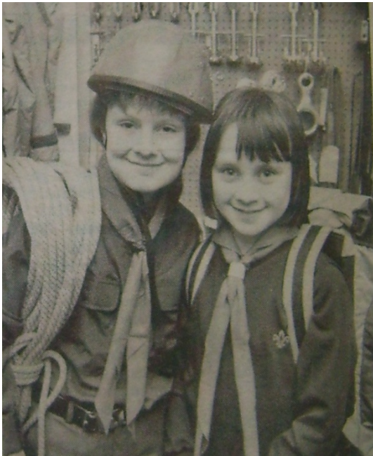
Figure 5: 'Call of the Scouts', Staffordshire Newsletter , 18 February 1990, p. 5

pictured in a traditionally masculine environment of a tool shed, dressed in full official uniform and adorned with outdoor equipment: