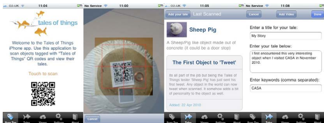
Figure 2: Interaction Sequence Mobile Client

For every new thing that has been added a unique two-dimensional barcode (QR code) that points to a unique URL (Uniform Resource Locator) on our server is created. This code can subsequently be printed and attached to the thing. When a Tales of Things QR Code is scanned via our custom clients the history of stories and interactions with the object is revealed. Figure 2 shows the enabling sequence of steps in our mobile client (an iOS client in this case) for accessing this information and for adding a new story (writing back to the tag). Since our QR codes point to a public URL, generic QR Code readers can launch the public view of the resource in a web browser. However, additional functions to add new tales to the object history require a Tales of Things specific client application. It is worth mentioning that people also can use the Tales of Things website to scan tags via their webcam which will also reveal the interaction history of the object. This has been implemented to enable access for people that have no smartphone. This was important for some of the community groups we worked with, as smartphones were not in widespread use in these groups.