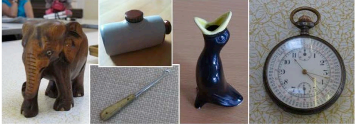
Figure 3: Participants objects on which stories were based

In one of the most comprehensive studies of personally meaningful domestic objects, The Meaning of Things [13], Csikszentmihalyi and Rochberg-Halton note the enormous flexibility with which meanings can be ascribed to objects (p.79), and they generally emphasize the importance of kinship, that is, of objects as evoking and reinforcing ‘social ties [...] that provide continuity in one’s life and across generations’ (p.86). The majority of the tales gathered during the present case studies can be described as relating to what the authors classify as mementos, that is, to things that are meaningful because they hold, evoke or stand for certain personal memories (p. 270f). A typical example of this, and one that (equally commonly) relates to immediate family, is a stone hot water bottle which was brought into the library by one older participant: