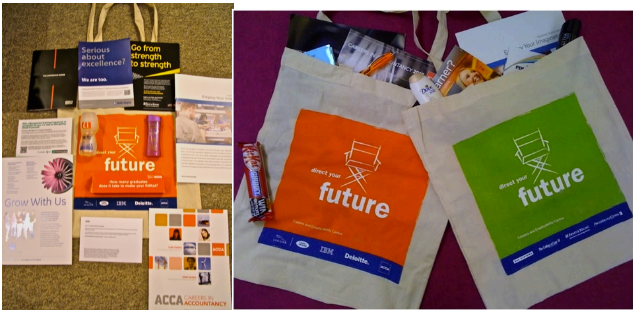
Picture 5.4 'Finalist pack'. The picture on the left shows the finalist pack that I got and the picture on the right is taken from the CEC's website (name of the university has been removed).

The informative part of the bag and the consumer part of the bag are listed in one line, giving these items the same importance. Finalists who are looking for jobs are also consumers, so the bag contains all they need. 'Whilst stocks last', however, even seems to put more emphasis on the consumption rather than the informative aspect of the bag. 'TBC' that is put in brackets after Mars Confectionary is written in capital letters, unlike any other word in the text, signifying the importance of not misinforming the customer. The bag that I got at the CEC contained the following 'freebies': a Unilever deodorant (with a £1 sticker on), a shower cream, and a KitKat. Nestle (producers of KitKat) directly address the student-consumer by writing 'How many graduates does it take to make your KitKat?' on the box.