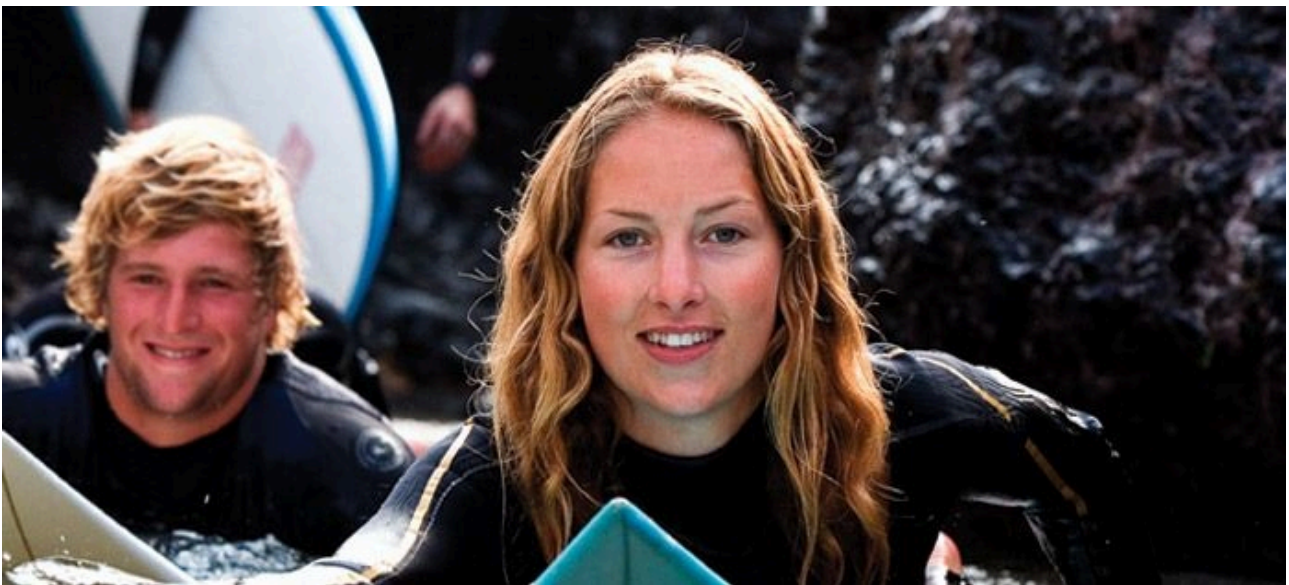
Picture 5.2 Picture from the front cover of PwC's 2012 graduate brochure