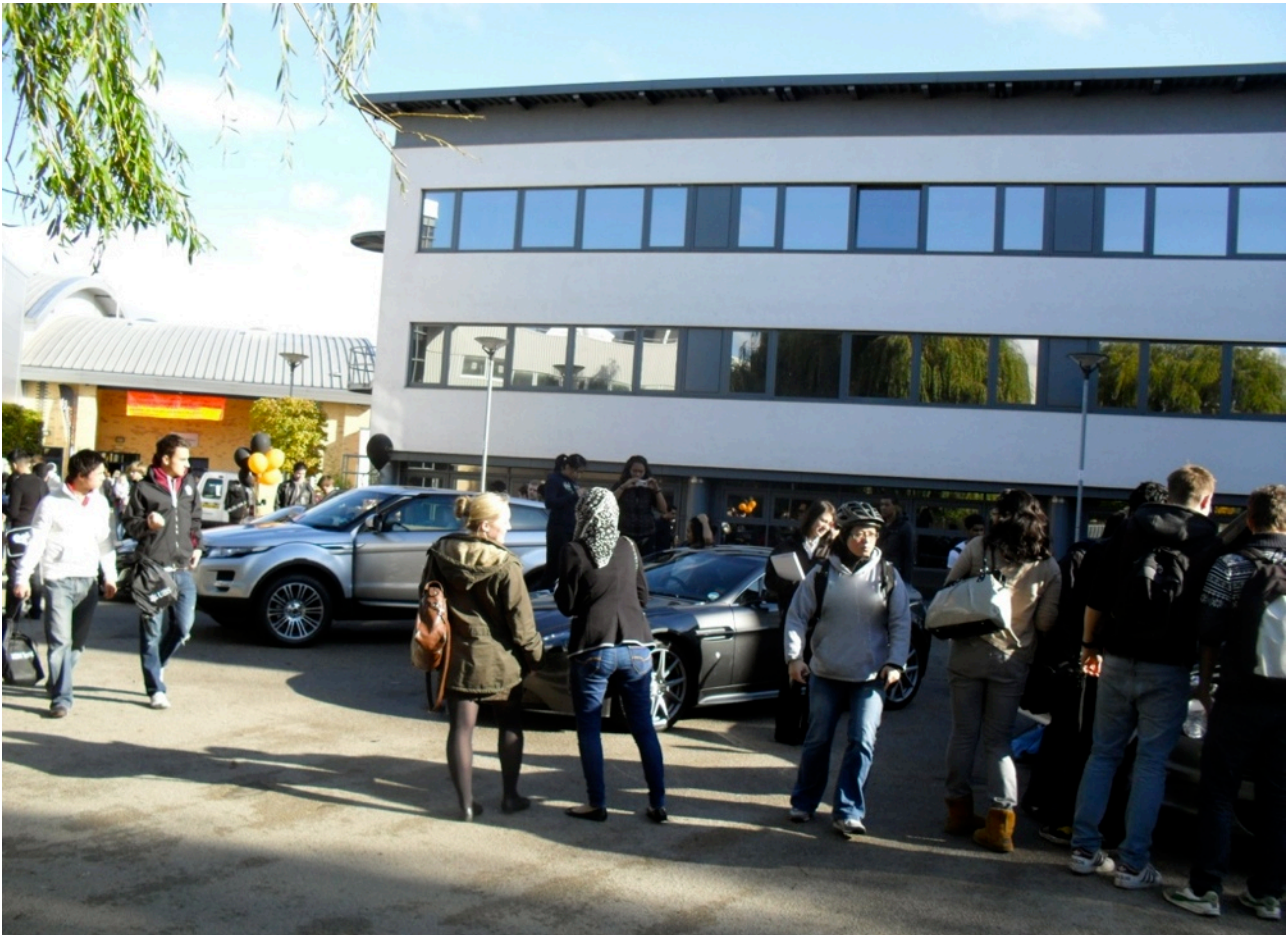
Picture 5.5 Luxury cars at the GRPF