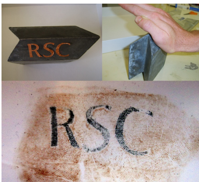
Fig.2 The effect of rubeanic acid treatment of a gel-lift from a hand that has briefly touched (top right) the copper logo on a lead brick (top left).

The overall process in question is well illustrated by Fig. 1. In this case a subject’s hand is in contact with two metal samples – a copper pipe and a lead brick. After a few seconds of contact time and then removal of the hand from the metal, a gelatine ‘lift’ from the palm was taken and the sheet treated with a 0.1% w/v solution of rubeanic acid in absolute alcohol within a standard dipping tray. Evidence for the presence of copper at the end of the fingers was manifest immediately by the dark blue/black colour apparent in Fig.1. Subsequent exposure of the sheet to UV light brought about the development of the brown colouration at the base of the palm area, indicative of the presence of lead. The key point about the image in Fig.1 is the distinct coloration associated with the two metals and clear delineation between areas of the hand which had touched either metal or indeed those areas which touched neither and thus appear blank on the developed sheet.