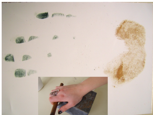
Fig.1 The effect of rubeanic acid treatment of a gel-lift from a hand that has briefly held a copper pipe while touching a lead brick (inset).

skin. 13 The development on the transfer medium in these instances showed substantial ‘bleeding’ as a result of the swatch material type, thereby prohibiting intricate detail, such as that required for fingerprint identification, to be obtained. Moreover, such a process still stained the individuals skin to some degree and best results occurred only when metal-to-skin or metal-to-fabric contact exceeded several tens of minutes in duration. A non-invasive variation of the iron reagent testing protocol has also been outlined by Lee through the transfer of residues on skin to wet filter paper. 14