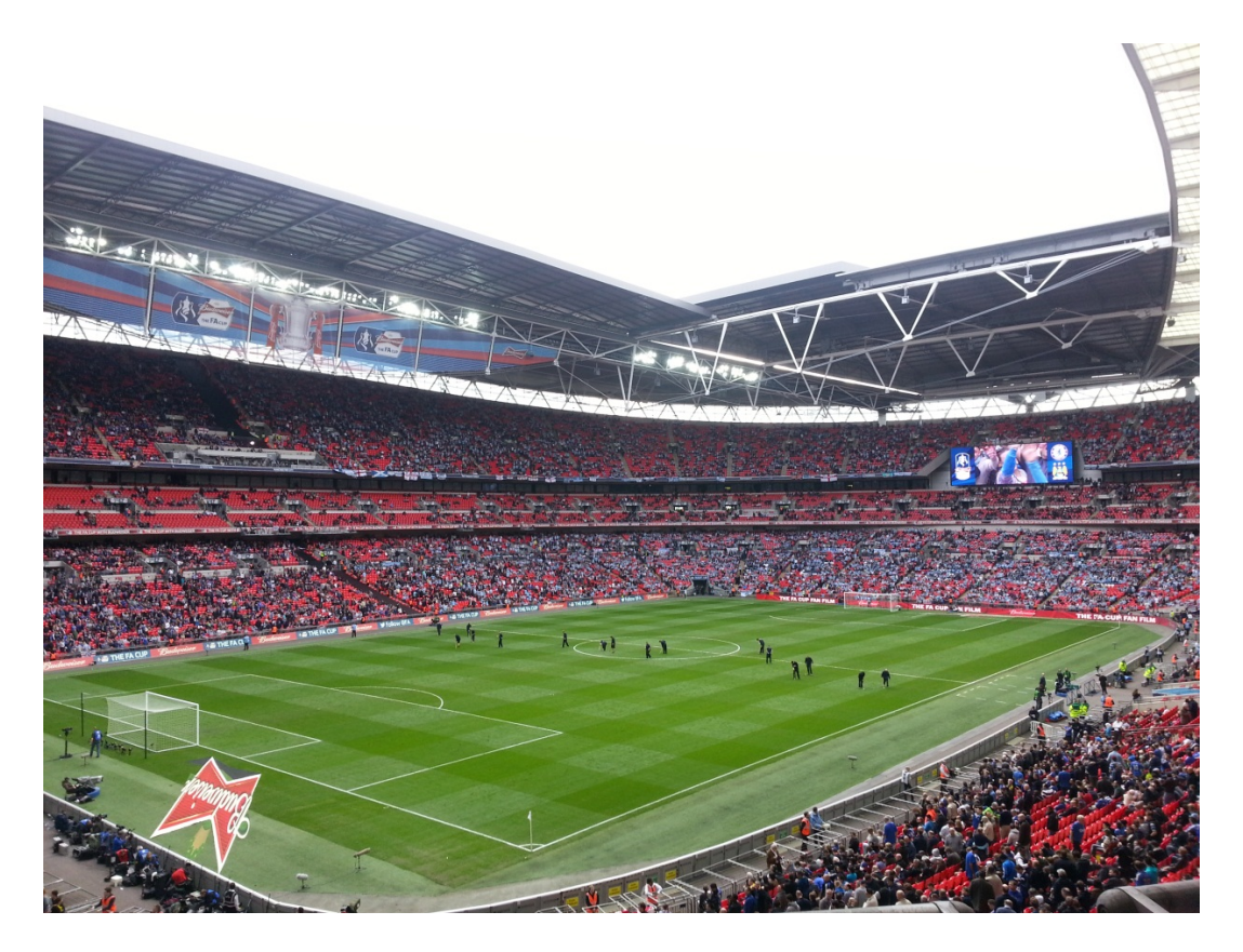
Figure 3. Fan photograph – 'The corporate ring at Wembley'

This passage again references a perceived decline in atmosphere in football grounds. It suggests the impact this is having on the fan of the appeal of elite professional football.