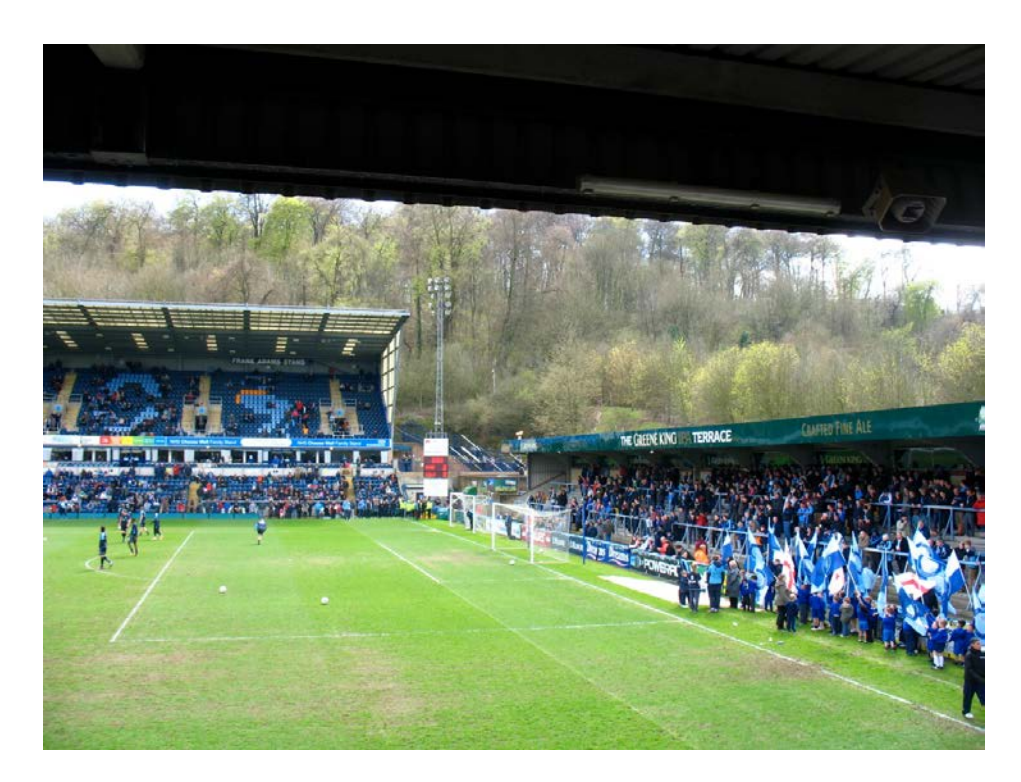
Figure 4. Fan photograph- 'A combination of the traditional and modern'

Purpose built stadium on the edge of town, corporate boxes, that is now called the Green King Terrace, so corporate sponsorship of the stadium, a dying image of football today is a standing terrace behind the goal, integration with local schools, getting kids involved, that's a positive sign of football today. Sums it up quite well. That's the modern and the old fashioned together. (League 2 club fan, male, aged 47)