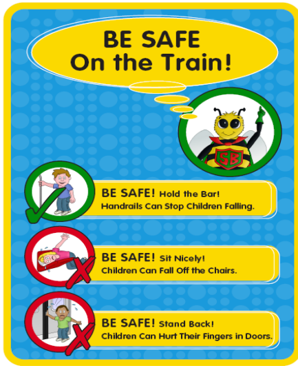
Figure 3: Example poster designed based on the outcomes from Workshop 2