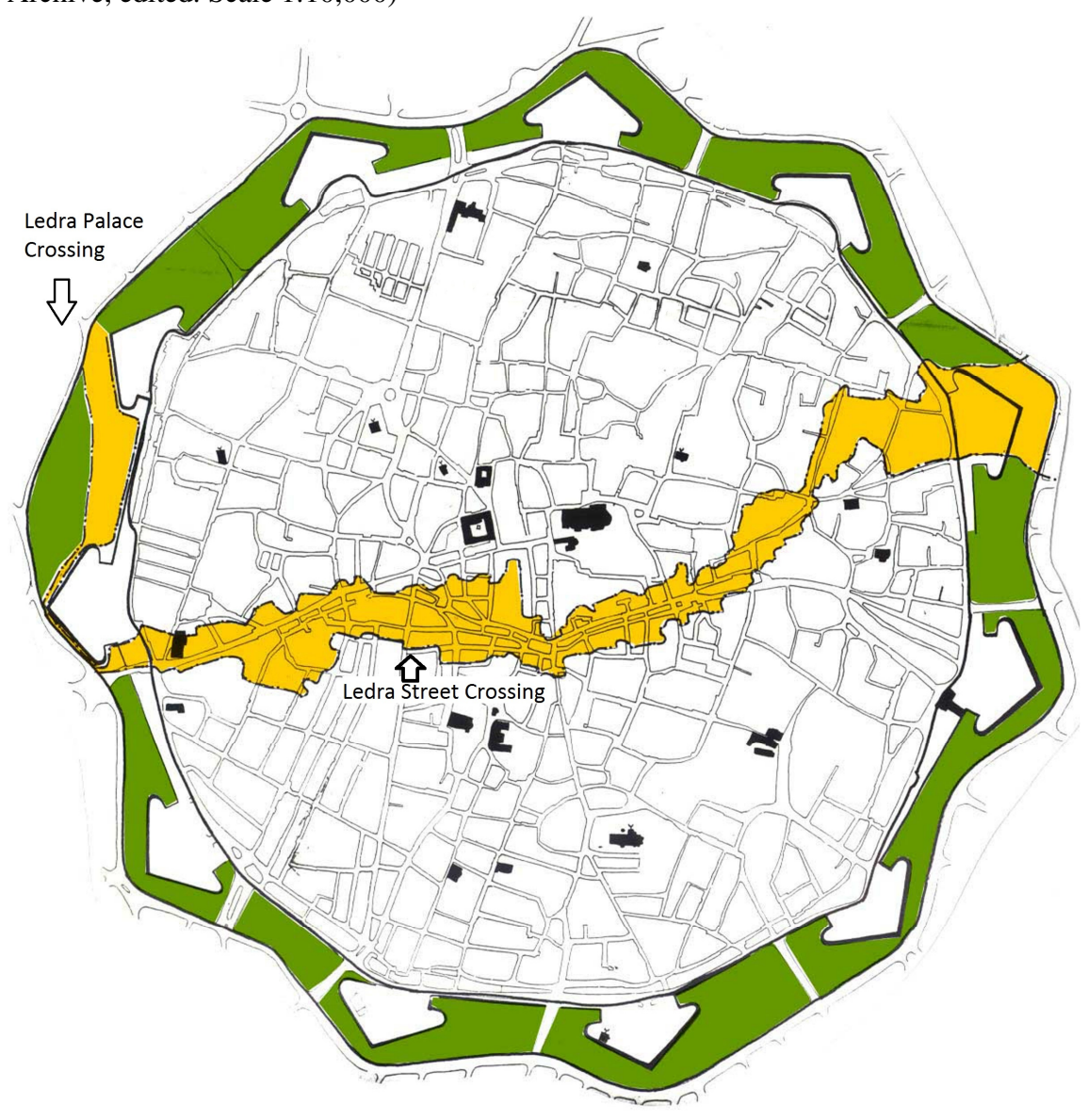
Figure 1 . Map of Old Nicosia showing the border crossings (source: Nicosia Master Plan Archive, edited. Scale 1:10,000)

Thrift N 1997 The still point in Pile S and Keith M eds Geographies of resistance Routledge, London 124-151.