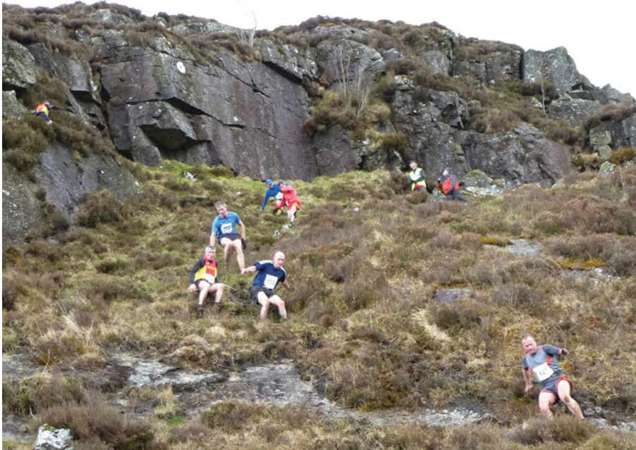
Figure 2 Runners descending the rocks and rough, boggy vegetation on the direct route at the Slieve Donard race (2013).

on well-made paths). (Note that the descent route at Pen y Fan qualifies it as being within the “steep, rough” category, although the ascent is on a well-made path at a less severe gradient.) Furthermore, values of \sigma_q are clearly greater in all the mountain races than in the road races; thus the variation in pace ratio among runners in mountain races is not simply due to varying ability to pace oneself in a race of such duration. (There is also some indication in Table 2 that \sigma_q increases with distance in road races, i.e. that runners’ pacing is more variable in longer races, but we shall not discuss this further here.)