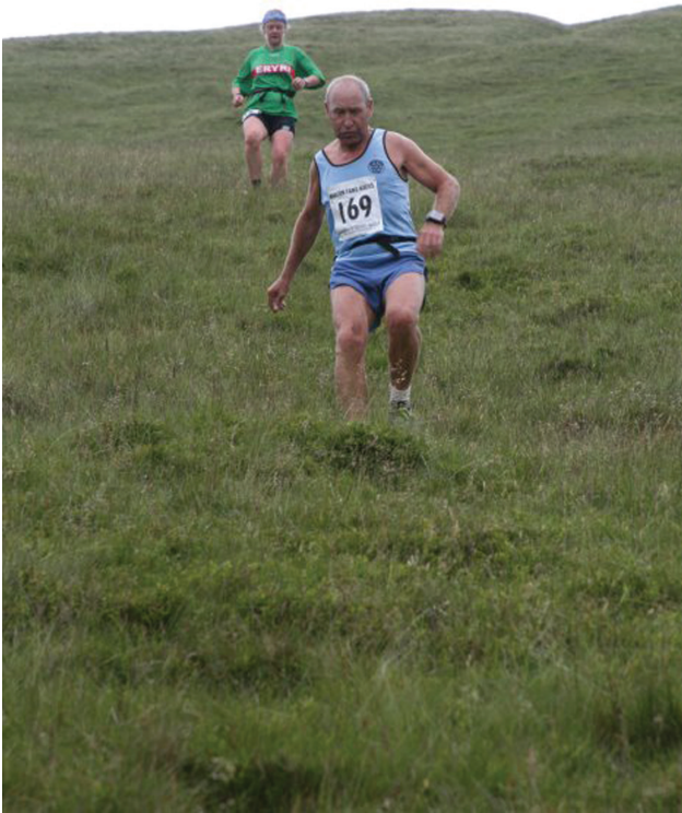
Figure 1 Runners descending the grassy slopes at the Pen y Fan race (2009). The descent is steeper overall but the terrain is easier than at Slieve Donard.