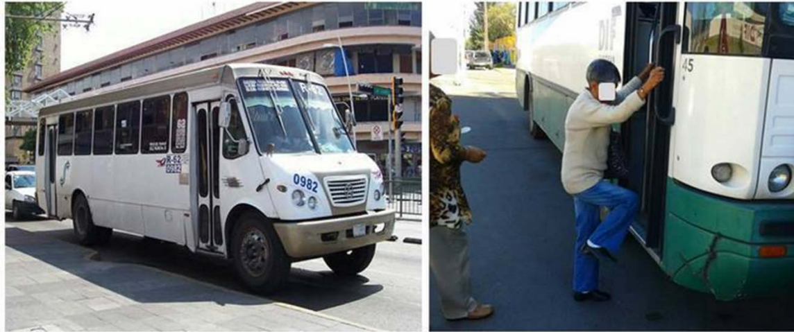
Fig 3 The buses were built on converted truck chassis

Due to buses being built on truck chassis, they all had high passenger platforms, no ability to lower the floor of the bus, and manual transmission. The handrails were generally placed horizontally on both sides of the gangway at a height of approximately of 175 centimetres. There were vertical handrails only near to the front and rear door. Most of the buses had a single bell placed on the vertical handrail close to the rear door at a height of approximately of 170 centimetres. The buses were designed so that passengers boarded at the front door and exited through the rear.