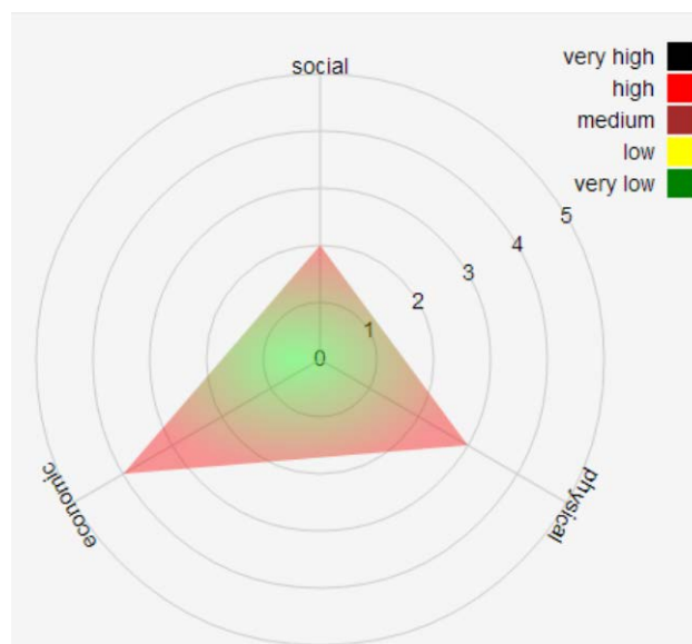
Figure 1 Example breakdown of the impact assessment scores

After completing this (and each following stages), the end-user is presented with a set of outputs for each hazard/ threat identified. The outputs include hazard/ threat impact rating; the exemplar case studies illustrating good (i.e. where the hazard has been identified and the benefits of this) and bad (i.e. where a hazard was not identified) practice; the list of documents that illustrate how to identify potential threats and hazards; and a list of tools useful at this stage, presented in detail in the Deliverable 2.2