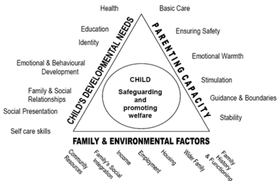
Figure 1.1: The Assessment Framework

(Reproduced from HM Government , 2013, p.20)