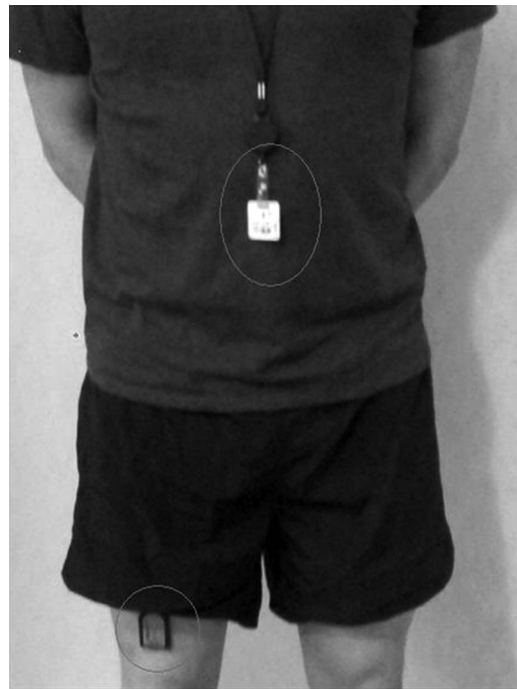
Figure 2 ActivPal accelerometer and radiofrequency identification tracking system to be worn by participants.

Participants taking part in objective monitoring will be asked to wear the ActivPal ( http://www.paltech.plus.com ; figure 2) all day every day (including during sleep and bathing) for five consecutive days. The ActivPal is a small (53×35×7 mm), lightweight accelerometer attached to the thigh mid-way between the hip and the knee. In the present study waterproof adhesive tape will be fitted over the device permitting bathing and swimming without the need for removal. The device classifies free-living activity into periods spent sitting, standing and walking, and it also records step count, cadence and transitions between sitting and standing. The ActivPal has been successfully used in studies of office workers and adults, 16 17 and has been validated for step count, cadence, time spent sitting, standing, walking and for identifying postural transition. 18 Grant et al 18 found the mean percentage difference between the ActivPal monitor and observation for total time spent sitting, standing and walking was 0.19%, 1.4% and -2%,