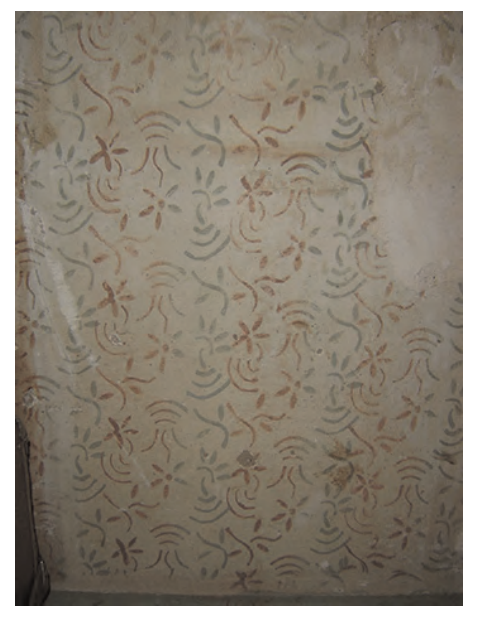
Figure 6: Hand stencilled "wallpaper", Tartu, 2006.