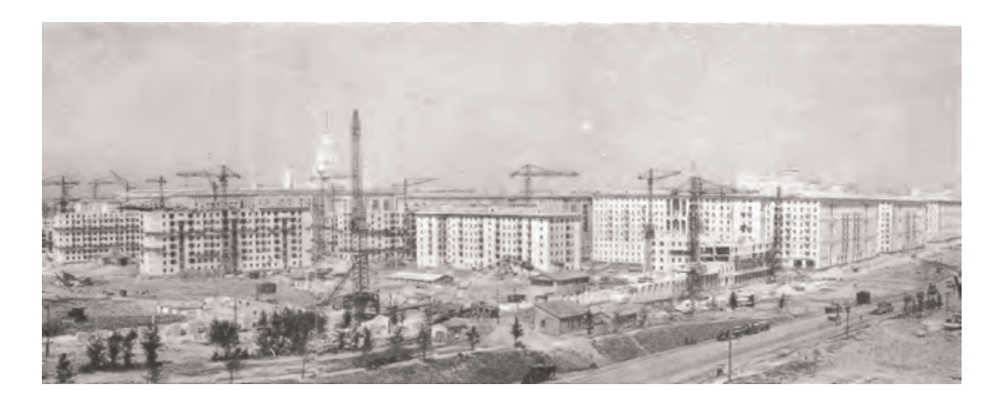
Figure 2: (Anonymous), "Panorama of Construction of the South West Region", Moscow, Arkhitektura SSSR, 8 (1957): 4

Party discourse of the Khrushchev era spoke of the present stage of socialism as that of "full-scale construction of Communism", a staging post en route to Communism.<sup>2</sup> Construction was not only a metaphor for progress but a material reality, as new housing developments or novostroiki