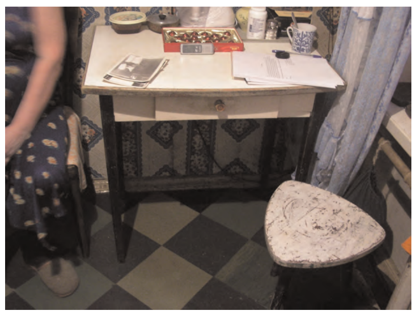
Figure 9: Larisa's table and stool: "Dad made everything himself." St Petersburg, 2005.