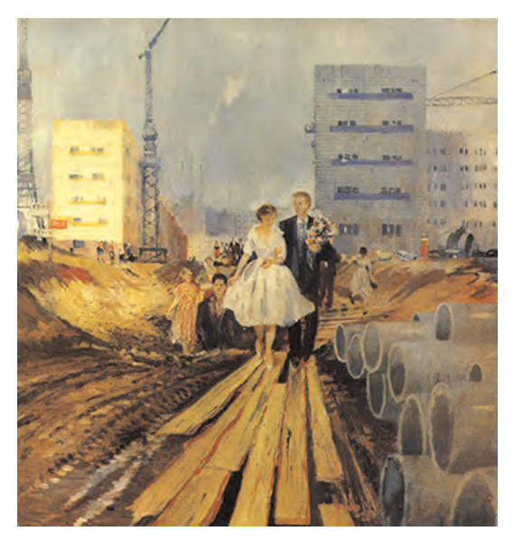
Figure 1: Iurii Pimenov, Wedding on Tomorrow Street, oil on canvas, 1962. State Tretyakov Gallery

here by an improvised affair of rough planks thrown down ad hoc across the mud out of which the neighbourhood-to-be rises. Soviet modernity, as represented in Pimenov's painting, is not something ready-made and finished, but is a work in progress.