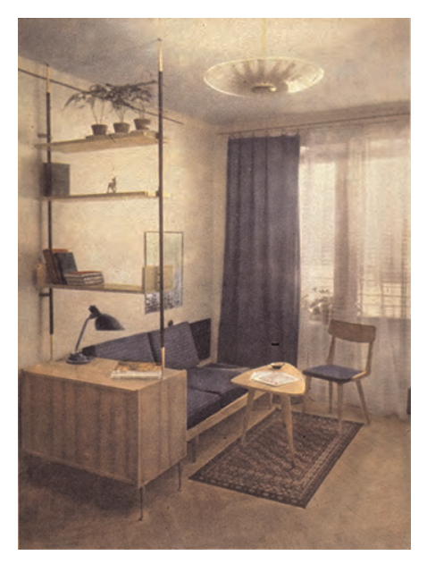
Figure 7: A model interior in the "Contemporary Style". Ol'ga Baiar and Raisa Blashkevich, Kvartira i ee ubranstvo (Moscow: Stroiizdat, 1962)

Here we have a contradiction typical of the paradoxes of Soviet modernity examined in this essay. This floorcovering that signified a modern, convenient, ease-full lifestyle (by contrast with the work entailed in maintaining natural wood parquet), had to be laboriously made by hand.