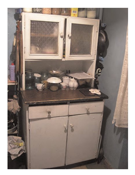
Figure 8: Evgeniia's handmade kitchen cabinet, St Petersburg, 2004.