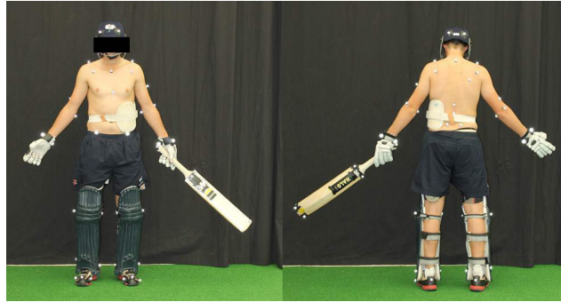
Fig. 1. Full body marker set used for motion capture trials

On arrival subjects put on their batting kit, and a full body set of 46 spherical retro-reflective markers was applied (Fig. 1). An additional five markers were placed on the bat, and six on the stumps. Finally, five squares of retro-reflective tape were applied to the ball such that its position could be tracked using the Vicon system.