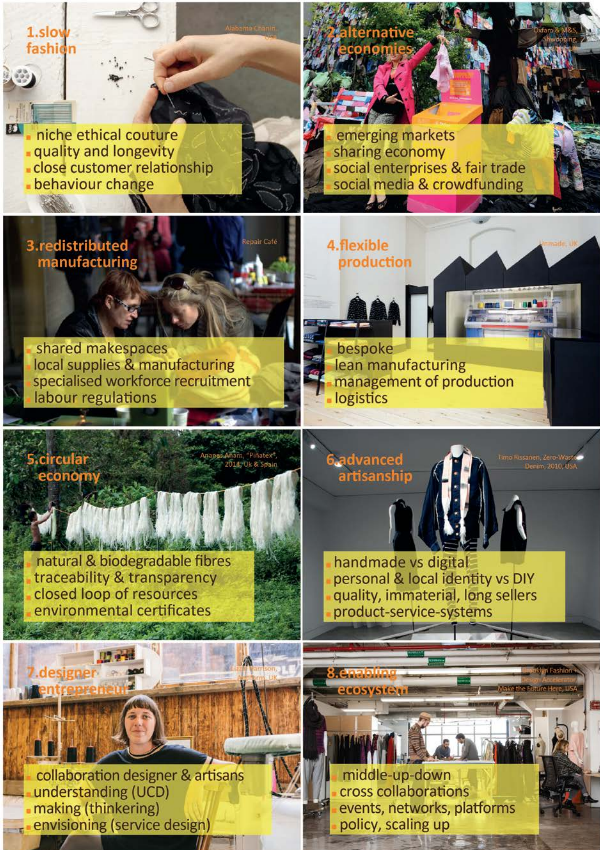
Figure 2 Future trends used for the scoping study.