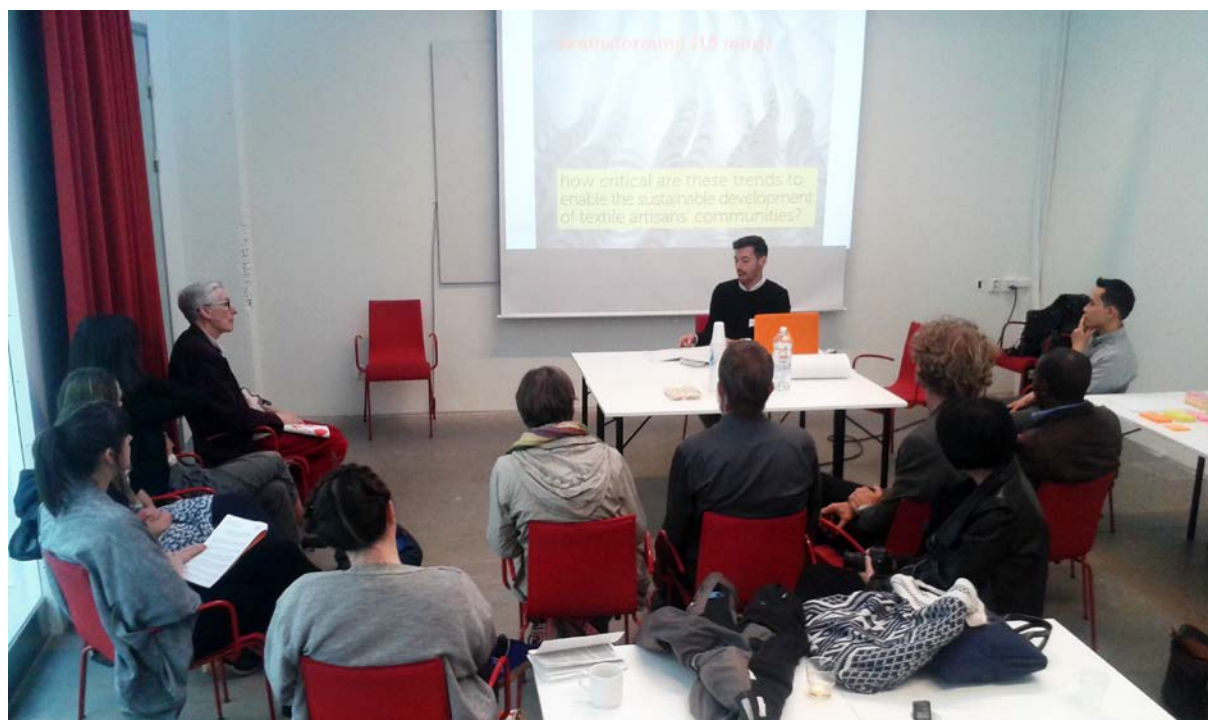
Figure 1 Nominal Group Technique at Konstfack.

theoretical framework for a sustainable future tailored to textile artisans' communities and inform future Participatory Action Research (PAR) phases of the research project.