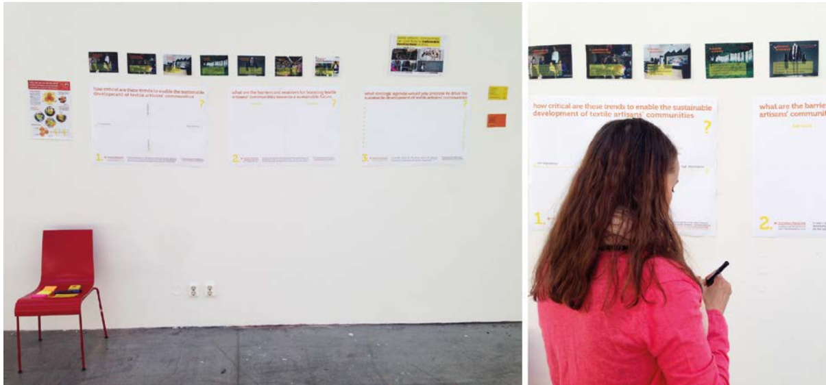
Figure 3 Contribution to NGT's templates at the exhibition space at Konstfack.

To ground the future trends on real world issues in relation to textile artisans' communities, respondents explored different case studies that allowed consolidating literature review and enriching the initial theoretical framework. At the end of the NGT, suitably designed templates were hanged in the exhibition space at Konstfack, so that new ideas could be added via post-its, widening the spectrum of responses (Figure 3).