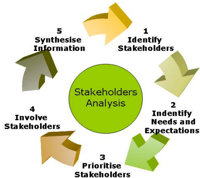
Figure 1: Stakeholder Methodology