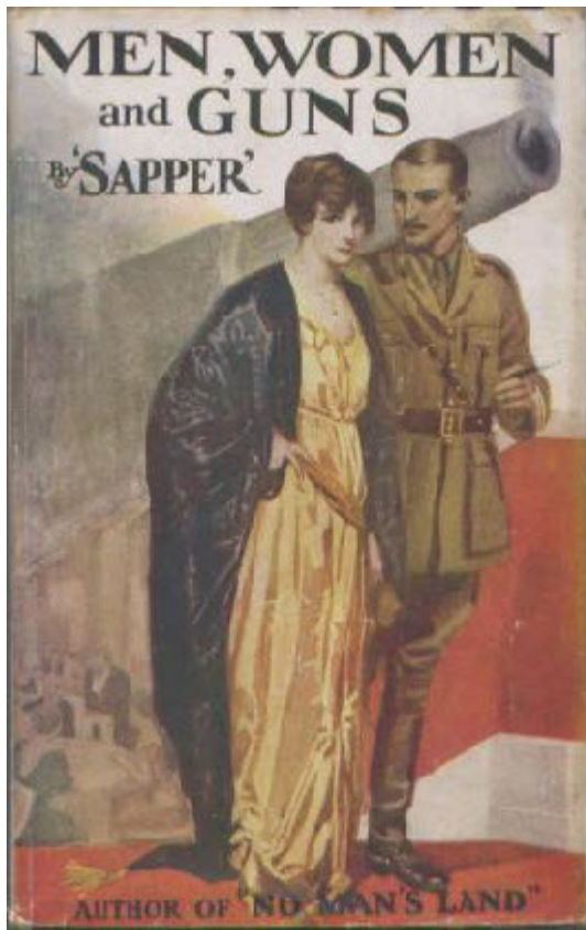
Figure 3: First cheap edition of Sapper's Men, Women and Guns (Hodder & Stoughton, 1917)

Hodder & Stoughton spent four times more on advertising Men, Women and Guns than on Non-Combatants and Others . 64 In one advertisement, Sapper is presented as the author of The Lieutenant and Others and Sergeant Michael Cassidy – “of which over 200,000 have already been printed.” 65 And like Sapper’s previous books, Men, Women and Guns went on to become a bestseller, selling more than 146,000 copies in the ten years following its publication. In contrast, printing and advertising figures show that the publisher invested fewer and fewer resources to promote Macaulay’s work. The Lee Shore was well advertised, it had a first printing of 9,000 copies (of which 7,873 were sold before the end of the financial year ending March 31, 1913), and it was reprinted in 1914 and 1915. For The Making of a Bigot , the advertising budget, 66 the first printing was also lower (at around 5,000 copies), and there was no reprinting. For Macaulay’s next novel, Non-