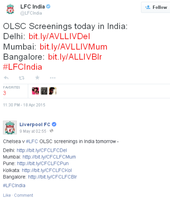
Figure 4 – Tweets and posts advising supporters where they can watch LFC games