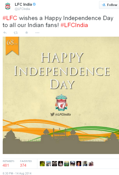
Figure 3 - @LFCIndia Tweet concerning Independence day in India, 14 August 2014