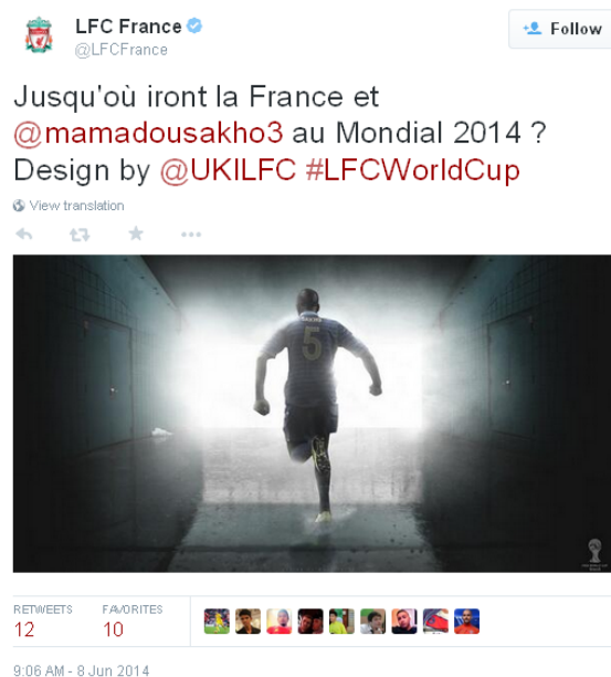
Figure 6 - @LFCFrance tweet mentioning Mamadou Sakho and the French national team