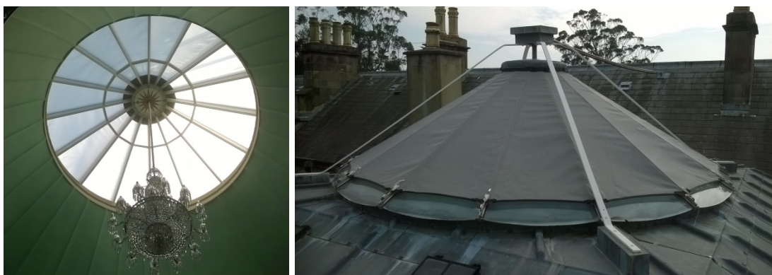
Fig. 8. View of the second light-reducing Phifertex® mesh to be installed, from below the dome (left) and as attached to the outside of the dome using marine fixings (right), March 2015.

Hambletonian was taken down and removed to storage in December 2013, whilst the building was redecorated. It was not rehung until early 2015. During 2014 the opportunity arose to improve on the prototype mesh installation. Richard Elphick identified a marine mesh product, Phifertex® (a grey vinyl coated polyester mesh), as likely to be more resilient to the weather and UV degradation and easier to make into the precise shape and size needed to fit the glazed dome. The mesh screen was made by a marine sailmaker to the architect's specification and delivered to site and installed in early 2015. The mesh was secured in place using catches and lines developed for marine use (Fig. 8).