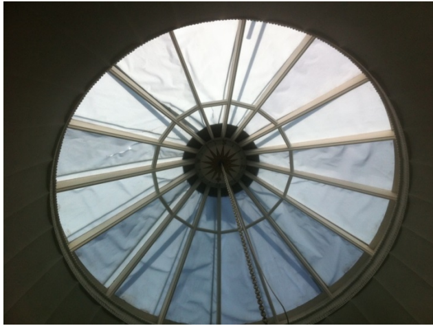
Fig. 7. View from below the staircase dome of the prototype light-reducing mesh cover, installed, May 2013. Creasing and a tear in the mesh can be clearly seen.

Hambletonian was taken down and removed to storage in December 2013, whilst the building was redecorated. It was not rehung until early 2015. During 2014 the opportunity arose to improve on the prototype mesh installation. Richard Elphick identified a marine mesh product, Phifertex® (a grey vinyl coated polyester mesh), as likely to be more resilient to the weather and UV degradation and easier to make into the precise shape and size needed to fit the glazed dome. The mesh screen was made by a marine sailmaker to the architect's specification and delivered to site and installed in early 2015. The mesh was secured in place using catches and lines developed for marine use (Fig. 8).