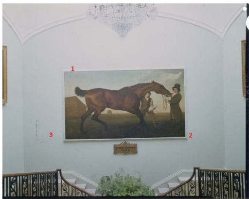
Fig. 4. Hambletonian as displayed in 2011 without light control and with the original flush-mounted wall frame. Radiotelemetric lux sensor and lux data logger were in location 1, blue wool dosimeters location 2. After redisplay in early 2015 the radiotelemetric sensor was relocated to location 3.

and an unobstructed sky incident on a horizontal surface. Diffuse horizontal illuminance is that which is due only to the unobstructed sky. The resulting annual exposure values for the blue wool dosimeters varied between 1.6 mlxhr and 7 mlxhr, a degree of variance substantially greater than expected. It was not possible to review in detail the Hambletonian blue wool monitoring procedures and exact locations from up to ten years previously. Since this variance does not accord with experience of using blue wool dosimeters elsewhere in the Trust, it was concluded that the data were not reliable and would have to be set aside.