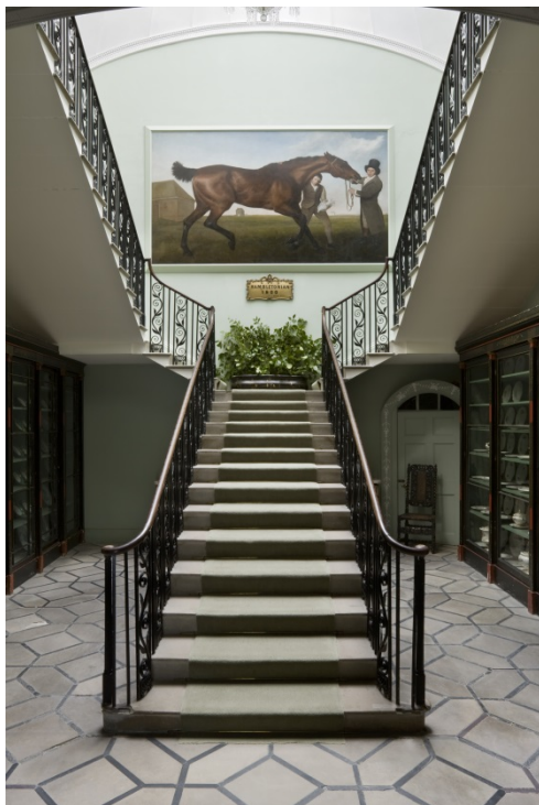
Fig. 2. The divided main staircase at Mount Stewart with Hambletonian, as displayed until the end of 2013.

Mount Stewart was bought in 1744 by Alexander Stewart (1697-1781), an Irish landowner and MP and founder of the Londonderry family fortunes. The original timber house beside Strangford Lough known as Mount Pleasant was remodelled in 1804 under the supervision of Alexander's son Robert Stewart, 1st Marquess of Londonderry. Influenced by the designs of George Dance the Younger, an 'imperial' staircase with divided symmetrical flights was built, lit dramatically by segmental pendentive domes (Fig. 2), a device adopted by Sir John Soane, Dance's pupil. Hambletonian's position here has been generally considered most suited to the painting's enormous physical (2.1m x 3.7m) and artistic presence. 3