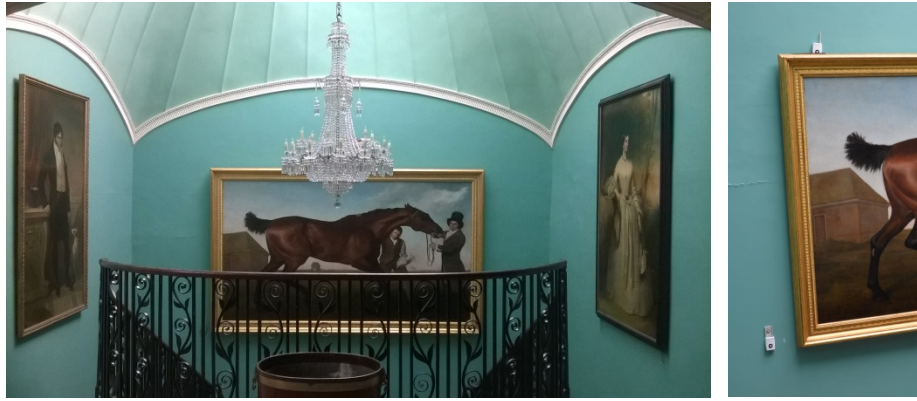
Fig. 9. Left: Hambletonian as redisplayed in March 2015, with new frame and paint finishes and Phifertex ® mesh in place over the skylight. Right: the two reference sensors in (1) the old top of frame and (2) new lower left monitoring locations, June 2016.