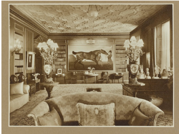
Fig. 3. Hambletonian displayed in the Library of Londonderry House, prior to its installation at Mount Stewart.

The research sought, through a combination of measured data analysis and climate-based daylight modelling (CBDM), to understand the current daylight exposure of the painting; and to test and quantify the impact of interventions to reduce light exposure.