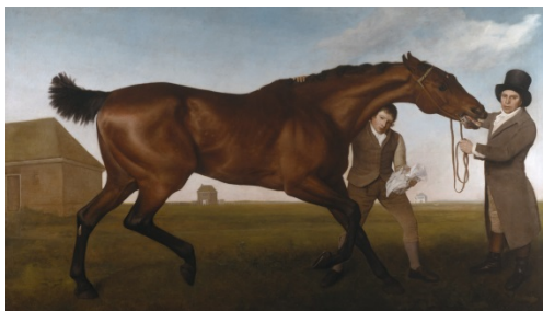
Fig. 1. Hambletonian, Rubbing Down NT inventory no 1220985, by George Stubbs RA (1724-1806)