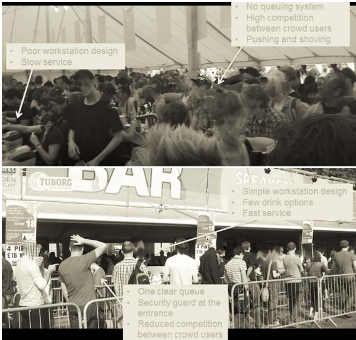
Figure 2 Examples of different queue management strategies seen during crowd observations