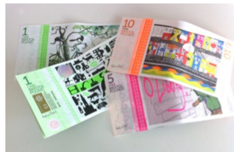
Figure 2. The Bristol Pound Notes

http://www.oisebristol.me/2012/09/25/by-virtue-and-industry/bristol-pound/