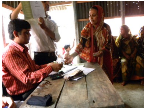
Figure 5. Grameen Bank borrowers attend a weekly center meeting to make loan repayments