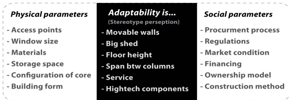
Figure 1: Expanding "black box" of adaptability

This research is looking at how design evolves through daily interactions, the events of which are shaped by the practice environment. In order to examine this we initially interviewed designers about their design philosophy and mindsets toward adaptability. We then carried out a secondary observation study of their internal design meetings as a window on how this plays out in practice. This afforded the observation of the interplay on several agencies on design innovation including physical and social aspects of the practice, and the project-specific elements of practice. We adopt an ANT-inspired approach in understanding how the networks between these agencies are formed and stabilized in shaping the production of adaptable design solutions. In this study, we focus on innovative design, particularly adaptability, as a complex design objective. To unpack this complexity, we examine the design process by expanding the black box around adaptability. Figure 1 highlights some of the typical features associated with adaptability in the centre box, and looks to expand to include other physical and social parameters. Our assumption is that innovative ways of thinking, managing and structuring the practice are needed to accommodate a more adaptable solution.